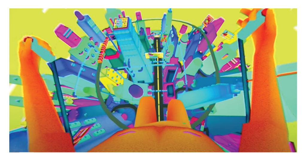
Figure 5. Stor Eiglass by Squarepusher: Looking down at the psychedelic city, the viewer's "body" is visible.

The above example with its realistic naked body demonstrates very clearly how the gendered body is always part of the design of embodied experiences. Whenever media imply an embodied experience or subject position, it is critical to ask the question: Whose body is it that is being implied? A major part of the utopian ideology of the digital-virtual environment is the freedom that the digital world grants us in transforming our "creative thoughts and imagination" into "reality and actuality through digital means" (Rambarran 1). Stor Eiglass depicts a parodic spin on this, as the nude body on display is at first coded male, and later (and without warning) female—at times it is completely motionless, and other times it moves in an autonomic fashion. Always visible is the decapitated neck upon which the viewer's lens resides. Ultimately, Squarepusher offers a humorous critique of utopian virtual ideology through this imagery, illustrating that in media that purport to transform a person into their ideal digital selves, the best they can offer is a new set of interchangeable avatar categorizations.