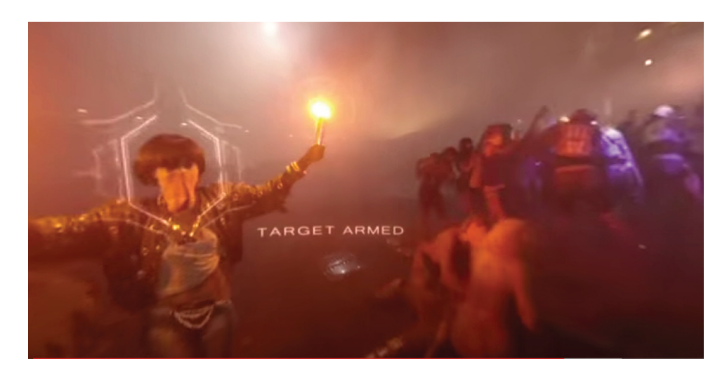
Figure 4. Revolt by Muse: a protester has been identified by the viewer's drone with the text "Target Armed".

Assisting in the development of the user-character's role is the presence of a body or an avatar. The above example illustrates this to an extent—the embodiment in firstperson of a surveillance drone is confirmed through the overlaid surveillance data, and the erratic movements of the camera, which mimic the movements of the other drones that are visible in the video, encourage the user to take the role of the camera by rotating their own view in erratic ways. Going further, one can be granted a human body or bipedal avatar, which can serve as a stand-in for one's own body and heighten the