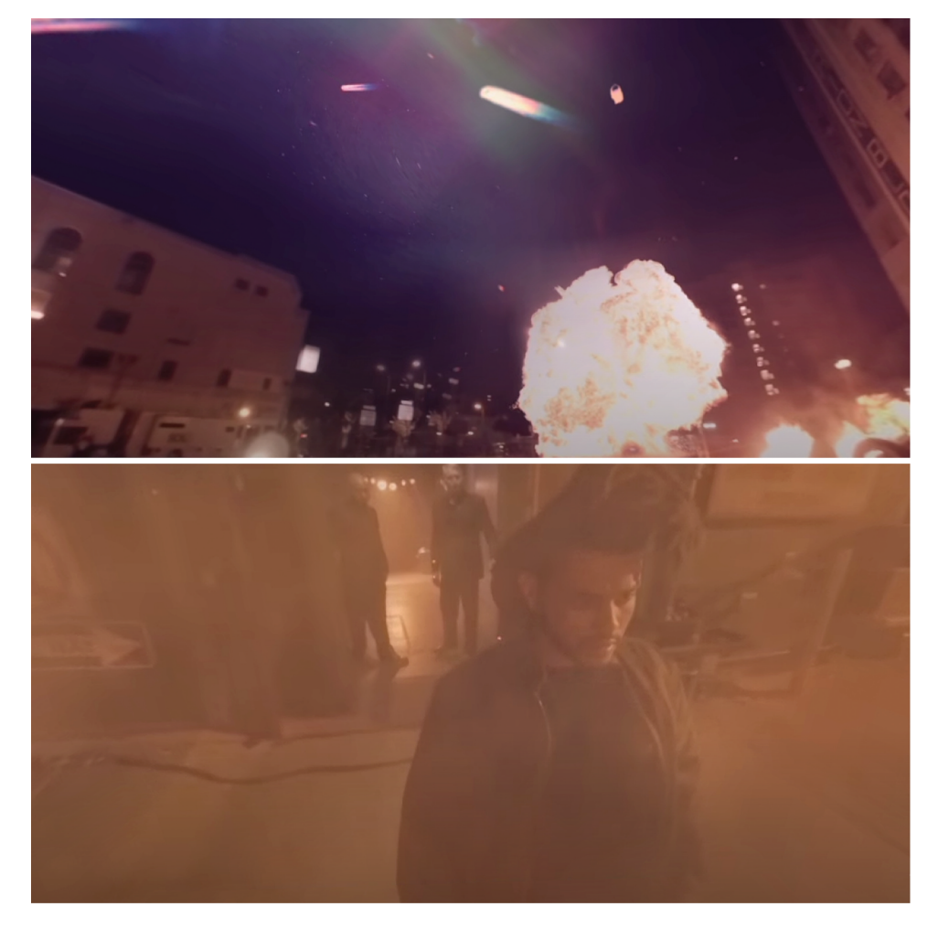
Figure 2. The Hills remix by The Weeknd feat. Eminem: front and back views as meteors destroy the city.

artist's slow walking out into a dystopian urban street at night (Figure 2). Initially, the view faces The Weeknd directly, although he never gazes to the camera, instead staring straight ahead with a look of complete absence. As the viewer rotates, they can see what look like asteroids crashing down on the city.