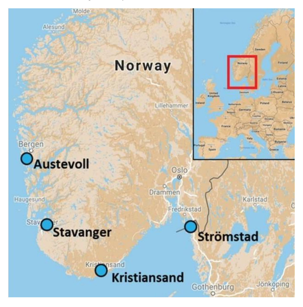
Fig 1. Map of Norway.

The study was conducted in Kristiansand and its region, and after the local government reform in 2020, Kristiansand municipality includes the Søgne and Sogndalen municipalities as well. Norway launched a local government reform in 2014 which reduced the number of municipalities to 356 effective, from 01 January 2020 (Regjeringen, 2020). This reform merged the counties of East Agder and West Agder into a single county of Agder, and the municipalities of Kristiansand, Søgne and Sogndalen into a single municipality of Kristiansand (Ibid....). The municipality of Kristiansand is situated in South Norway approximately 300 kilometres distance from Oslo where the municipality is the 5th largest city and the administrative centre of Agder County.