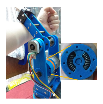
Fig. 2: A soft robotic arm is in a compressed state due to the collision with the environment [9]

Besides softening the interaction force by designing soft joints from a mechanical perspective, imposing desired behaviour on the robot can also be done from the software