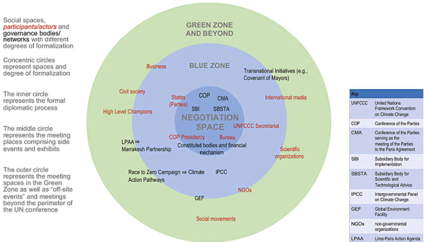
Fig. 1. Illustration of UN climate conferences (Obergassel et al., 2022, p. 3).

interviews (Klein et al., 2021). Online digital support can thus be either an enabler or inhibit constructive outcomes of COP meetings. The underlying problem is the tensions in global climate negotiations, which are blocking the progress and action that is needed. According to the Intergovernmental Panel on Climate Change (IPCCC), there is a strong urgency to change course immediately if the severe effects of climate change are to be prevented (IPCC, 2021).