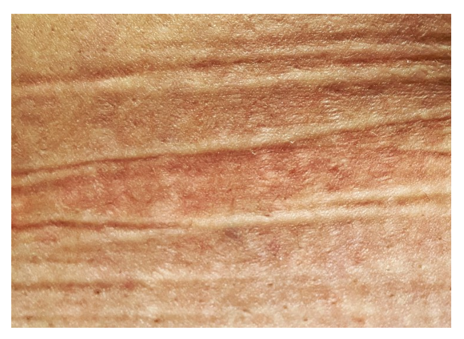
Picture taken during workshop about Prepositions by Lisbet Skregelid and Helene Illeris