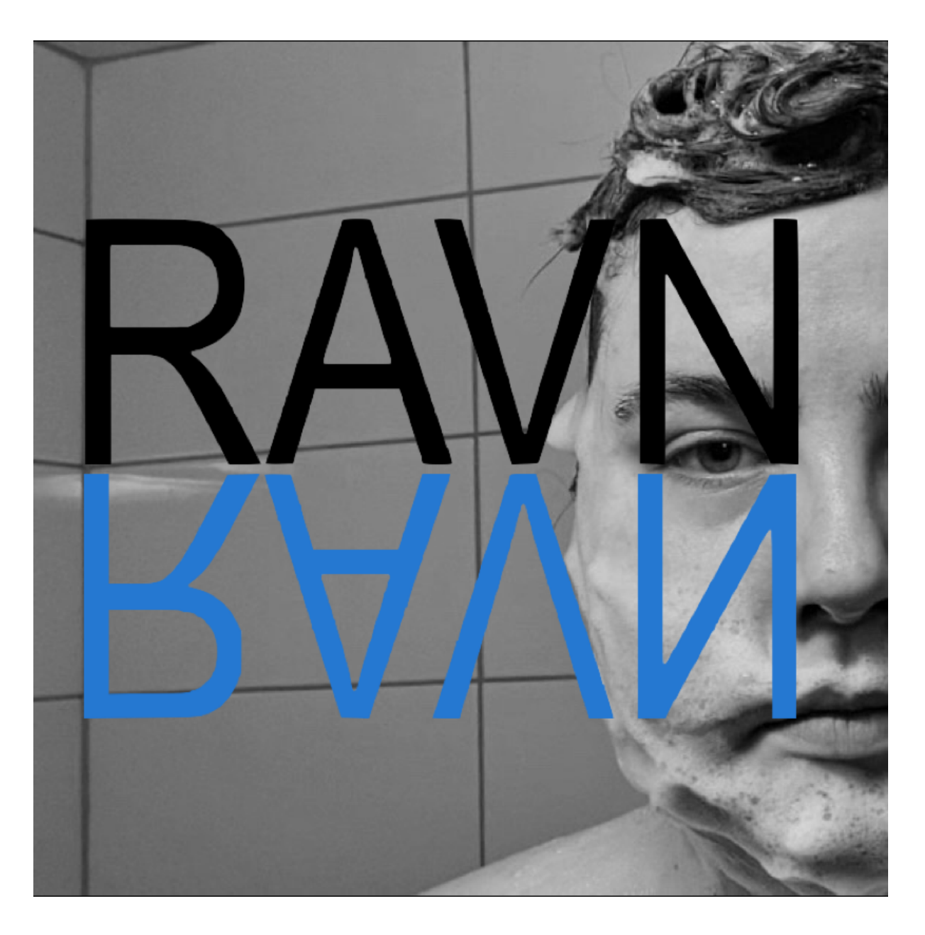
A performative exploration of gender, transformation and identity