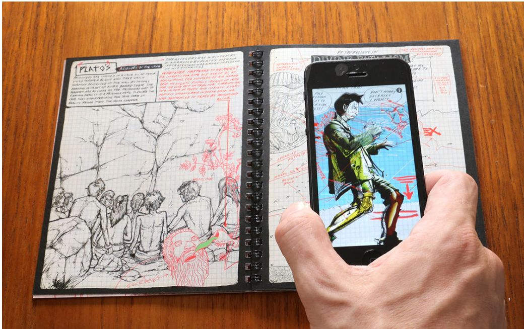
Figure 1. Reading Modern Polaxis .

The AR comic Modern Polaxis [Campbell 2014a] consists of a physical book and an accompanying phone app that supplements and changes the appearance of the book's pages (see Figure 1). We chose this work to study how AR functions in narrative fiction, because the app consistently adds a layer throughout the comic book, as Helms [Helms 2017] suggested. AR literature is still in its becoming, and few examples of narrative works take advantage of AR in creative ways. A variety of combinations of the virtual and what appears as "real" in some sense may be envisioned. After concluding our analysis, we return to a discussion of how our findings may be relevant to AR storytelling.