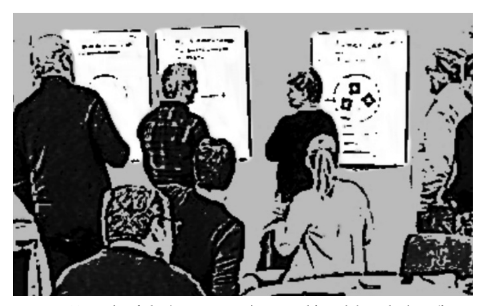
Figure 4.4: Topics identified as 'Requires Action' were voted for and chosen by the staff

of each colour representing the statements the group felt best matched the colour's meaning.