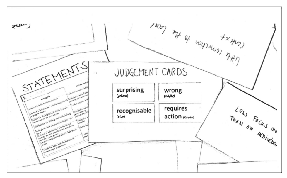
Figure 4.1: Work with statements and judgement cards

her opinion on the statement. The facilitator provided the group participants with an illustration showing the meaning of the colours (white = statement is wrong ; yellow = statement is surprising ; blue = statement is recognisable ; and green = statement requires action ).