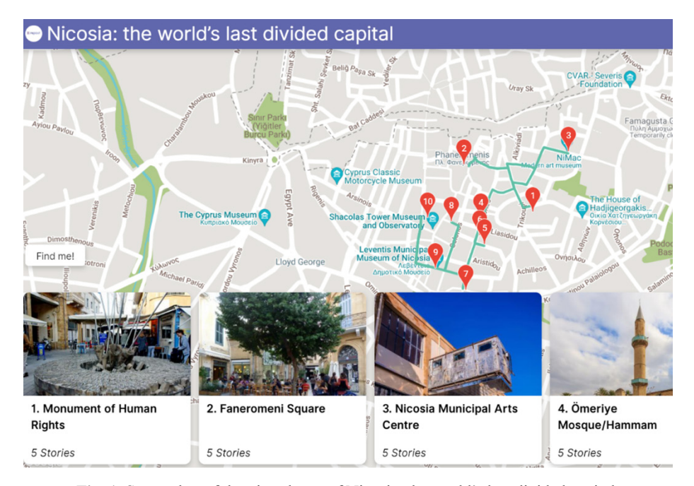
Fig. 1. Screenshot of the virtual tour of Nicosia, the world's last divided capital, showing four of the ten stops

In each virtual tour there are 10 stations that show 10 historical landmarks of each city in 3D format (Figure 1). In each station there are three stories promoting both perspectives of the conflictual past (in this example Greek-Cypriots' and Turkish-Cypriots' perspectives) and a multiple-choice question (Figure 2). The tours embed short quizzes after each stop to boost engagement and create incentives for the completion of the whole tour.