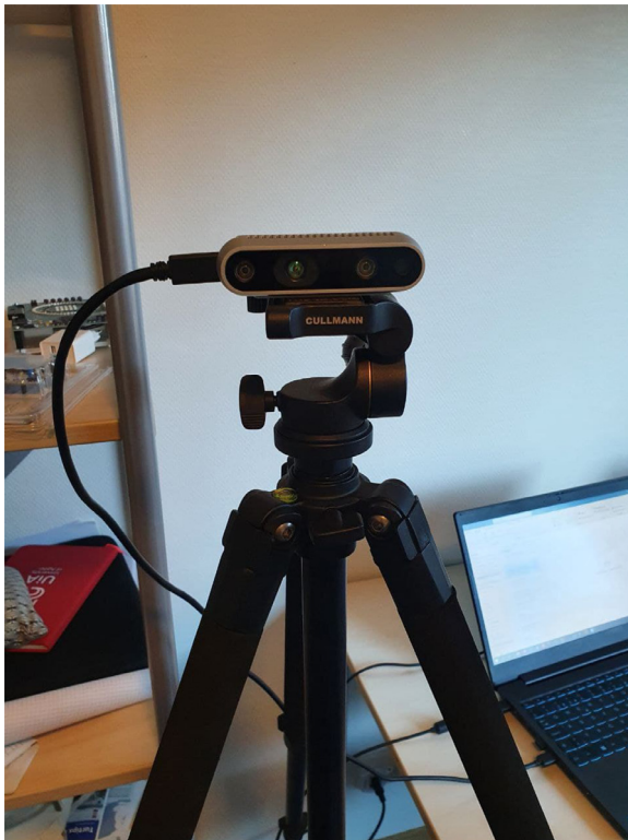
Fig. 4. Intel RealSense Depth Camera D435 camera module.

We used RGB-D (Intel RealSense Depth Camera D435) camera module as shown in Fig. 4 to capture the hand gestures of an individual. The camera has the maximum range of 10 meters and supports two channels one for capturing RGB stream and other for capturing depth stream. The camera provides a field of view (FOV) of 87^\circ \times 58^\circ for depth version and FOV of 69^\circ \times 42^\circ for RGB version. The Intel RealSense D435 camera is self-calibrated and supports a hardware sync signal for multi-camera configuration [2]. By default, it is self-calibrated and we took all measurements with the default calibration settings. Normally depth stream is supposed to have a dimension of 480 \times 860 [2]. In our set up, we lowered the dimension of depth stream to 480 \times 640 to match the dimension of depth stream to that of RGB stream. In this way, we tune all the parameters to sync the frames of RGB and depth versions. Fig. 5 depicts the complete setup for capturing and saving the RGB and depth stream data to the computer. In order to maintain the proper stability, the camera is placed on a tripod stand [3] as shown in Fig. 4 to collect the data. The camera is connected to Lenovo thinkpad x1 carbon gen 9 [4] computer via USB-C to USB-3.0 port to capture the video sequence. Finally a python script was developed to successfully save the recorded video frames from both RGB and depth streams in the computer.