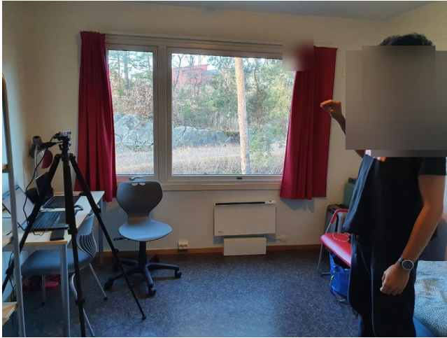
Fig. 5. The RGB-D camera setup for the collection of hand movement frame dataset.