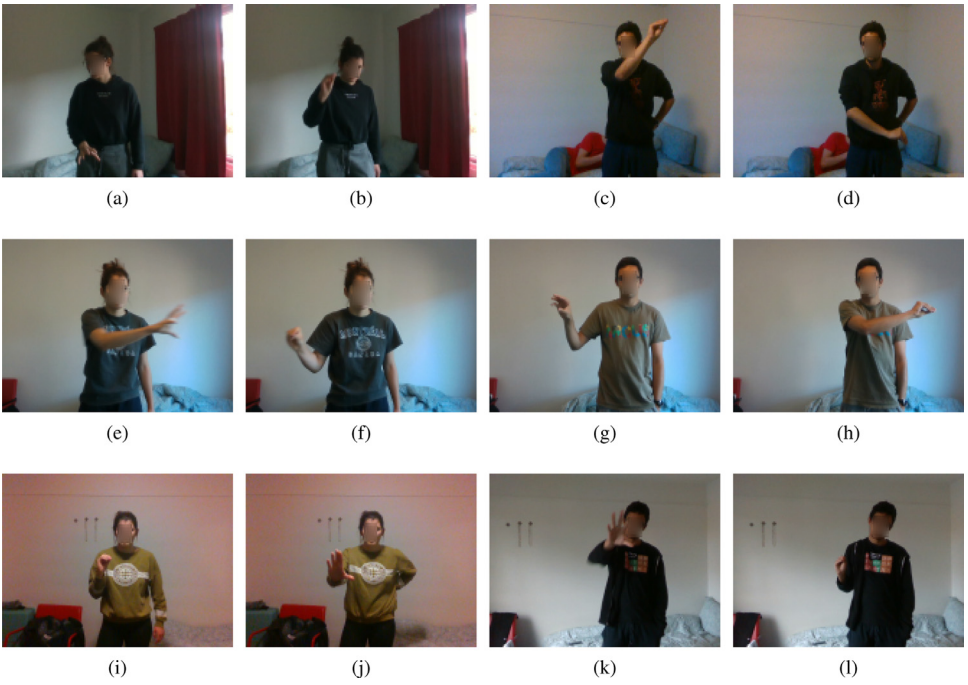
Fig. 2. A complete set of RGB version of gestures.