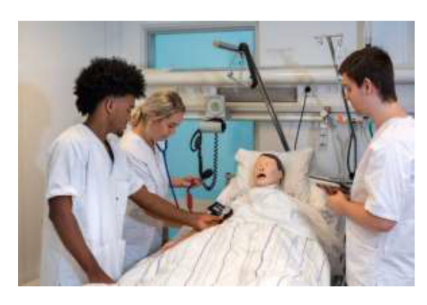
Fig. 1. Nursing students training vital skills with a medium-range manikin.

Simulation-based activities are prominent and appreciated educational methods that contribute to the acquirement of many qualifications required in nursing practice, such as cardiopulmonary resuscitation (Ackerman, 2009) and medication administration (Fusco et al., 2021). The simulation field covers a complex range of methods, where the use of full-sized human-like simulators with varying technological features is prominent. In educational practice, the simulator, or manikin, represents the patient (Cooper & Taqueti, 2004; Lioce et al., 2020). The most advanced manikins can respond with a wide range of reactions, and different parameters can be monitored. Medium-range manikins have fewer responses and afford fewer options. The simplest manikins may have no technological features and are commonly used for practising technical skills. This study focuses on all kinds of full-body manikins and their impact on nursing students' learning, regardless of technological level, excluding body parts, such as arms to practice injections or skin pads to learn suturing. Fig. 1 shows nursing students training vital skills with a medium-range manikin.