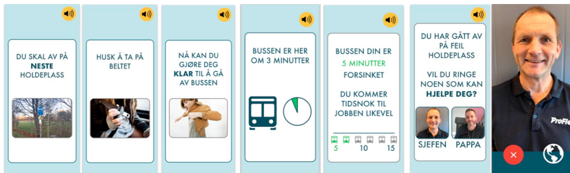
Figure 4A-G: 4A-C show examples of reminders in the prototype, 4D-E show visualizations of time management, 4F-G show communication options in the prototype.

To travel independently, it is vital to know what to do when you miss a bus or get off at the wrong stop. Participants in the early stage of the project shared examples of how they, or other people with IDD, would take one bus earlier than needed in order to avoid having to deal with a potential delay - choosing instead to arrive much too early for work. Examples were also identified of people with IDD that had used Facetime as assistance when getting lost. The prototype therefore included a function for communicating with a set of predefined actors. Due to our focus on employment, the options were to contact a manager or a parent. The first prototype included a shortcut to a phone call and also the opportunity to share your current location (see Fig. 4F-G).