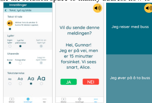
Fig.5. Example of screens from the second version of the prototype, including customization, a prewritten text message and training modes towards taking the bus.

All workshops revealed that a central aspect of transport support is the pedagogy of facilitating a personal development and learning. We found that the participants who already did travel independently, did so after extensive training and repetition and had learned how to anticipate and manage the transport situation. The second version of the prototype therefore supports training towards taking the bus and customization of the reported functions (see Fig. 5). As an overall evaluation, we noted that the majority of the transport aspects above, are unique to each individual and context dependent. While customizations of the application can support individuality and situational aspects, we were able to understand and reframe the solution space to mainly address how to manage unforeseen events.