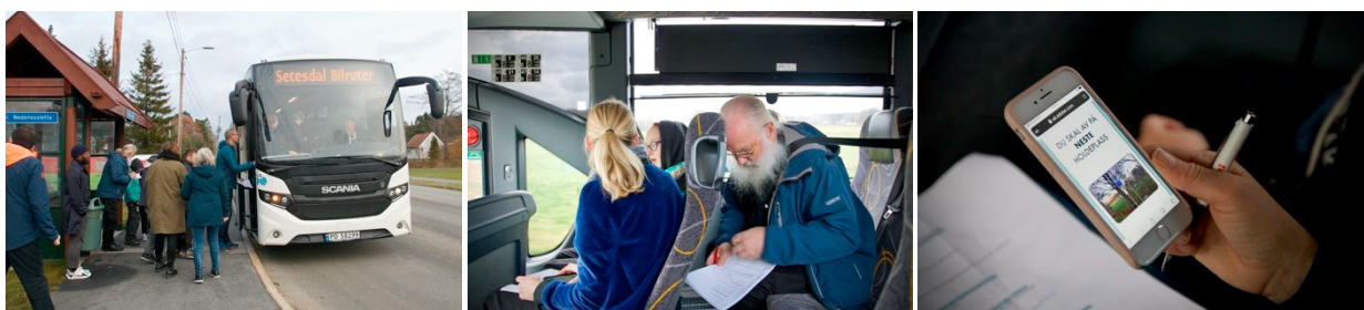
Fig. 2. The rented, local, public bus and set up.

The bus workshop was staged as an everyday public transport setting and consisted of scenarios based on the previously identified elements: identifying the correct bus, receiving reminders (before, during and after), time management and communication with parents and employers. To carry out the workshop, we rented a local bus complete with a regular bus driver. Prior to the workshop, the researchers had a walk-through of the planned route and scenarios, and instructed the bus driver. Three researchers also met with the potential participants and a proxy (teachers and a manager) to present themselves and the research project, answer questions, and propose the scenarios. The meeting enabled us to familiarize ourselves with the participants and their range of abilities thus ensuring the relevance of the scenarios. The scenarios were run three times with twelve participants in total. The first group consisted of five participants from an adjusted work placement, and the two other groups of three and respectively four students from a secondary school. The participants included six women and six men, out of these ten participants were adolescents and two participants were adults. All participants were able to express themselves verbally, had previous experience of taking the bus but only three did so independently. Eight researchers participated in the bus workshops, four as facilitators and four as observers (see Fig. 2)