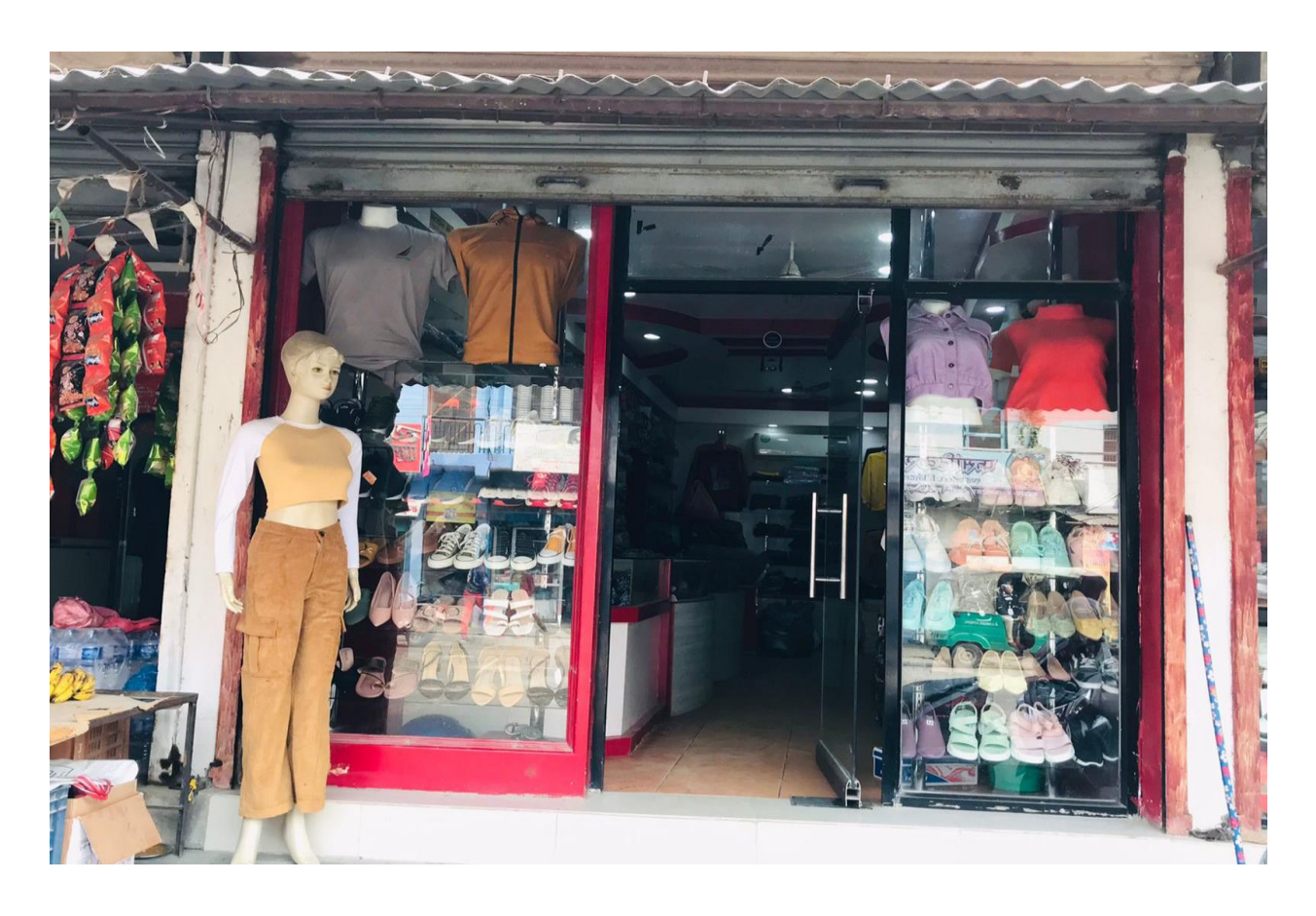
Figure 3 Even after the lockdown, customers are not seen in the shops and stores—Photo Source: Researcher (March 2021).

Small scale business holders believe that daily wages-based people and families of the migrants' workers, middle-class families are the primary consumers and customers of their goods and services. As lockdown created crisis and loss of the jobs of domestic and migrant workers is also creating a more significant impact in the business. On the other side of the business activity, even after the partial opening of the lockdown, people are not visiting stores and shops because of the fear of Covid-19.