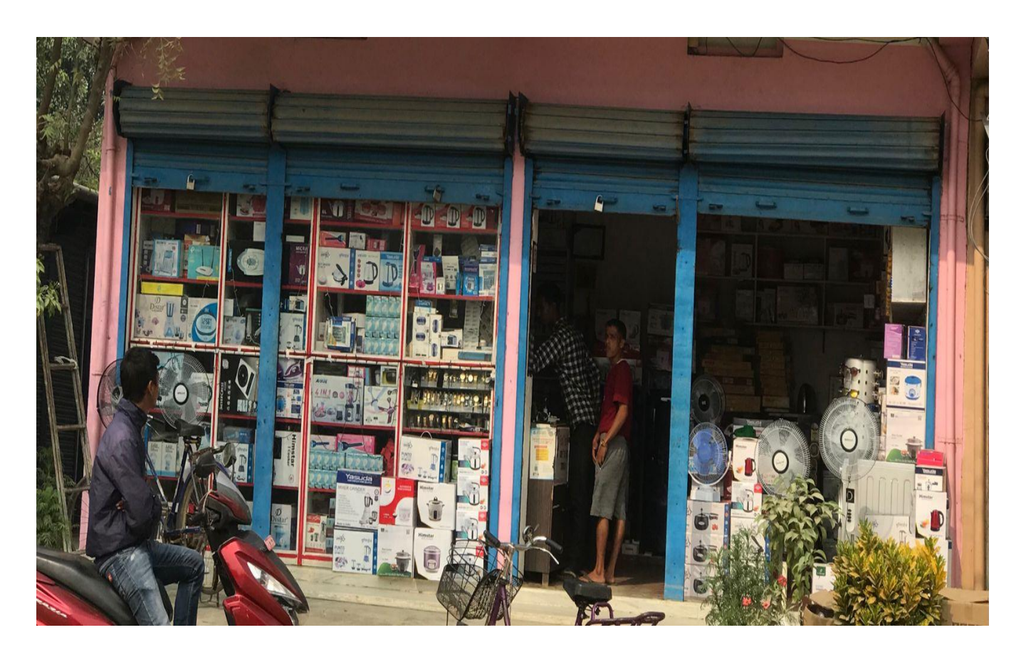
Figure 4 Small-scale business holders are conducting some business activity after the lockdown. Photo Source: Researcher (March 2021)