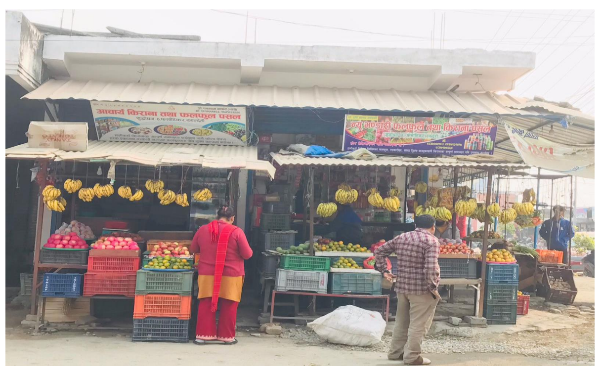
Figure 1 Small and Informal Business are open after the Lockdown in March, 2021 but business activity is very low.

In this study, small-scale businesses refer to business activities conducted with less capital (from $1000 to $10000) and few employees (3-5 employees). Small scale businesses have prevailed and are very common in the study area, i.e., Butwal Sub-Metropolitan City, Nepal. In this study, various business activities are included, such as cafes, small restaurants, motorcycle workshops (which repairs motorbikes), small construction companies (which work for repairing and maintenance), vocational training institutes (which provides different vocational training such as barista, bartender, cookery), education consultancies (which provide counseling and guidance to students for abroad and domestic studies), fancy shops (clothes retailer), small grocery shops, fruit shops, job providing agency, tours and travel companies and color house (home color paint retailer). The researcher collected and interviewed small business holders from service-oriented businesses and goods selling businesses in this study. These business activities seem directly affected by the Covid-19 crisis pandemic and its consequences. Therefore, interviews with such business holders are the prime determinants of the findings.