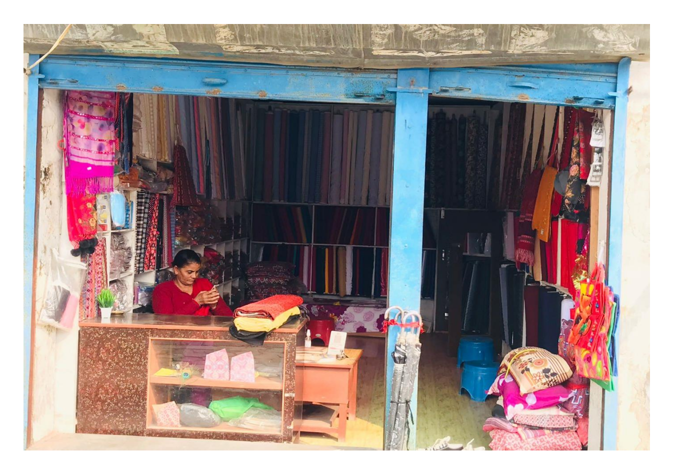
Figure 2 Small-scale Business holder waiting customers to visit the shop.

Delivering goods and providing services in a new model through convenience means is also a challenge for them. Business holders are not aware of the alternatives means to conduct