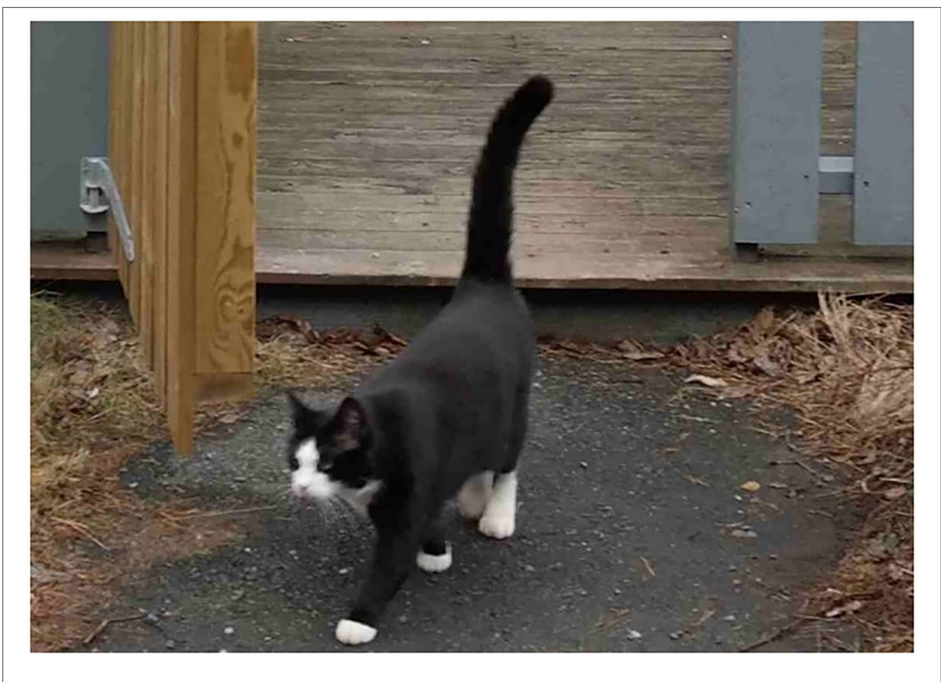
FIGURE 3 | The wandering cat "M".