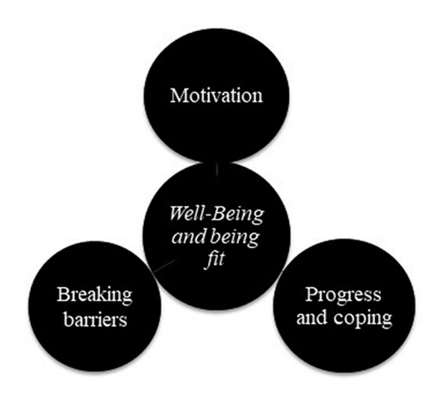
Figure 1. The three main themes that emerged from the analysis: 1) motivation, 2) progress and coping, and 3) breaking barriers coping. These fit within the study's main finding and overarching theme well-being and being fit.

three focus groups and four to five participants in each of these groups ought to be sufficient for both code and meaning saturation (Hennink et al., 2019).