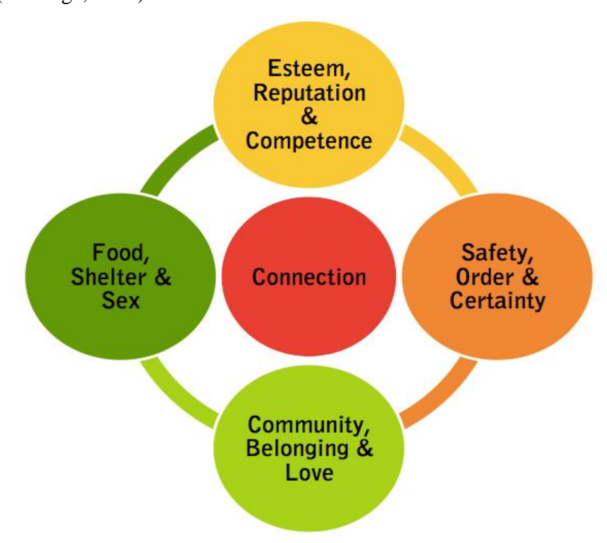
Figure 5 Maslow's hierarchy of needs renewed

Hustinx argues that the changes within the field of non-profits and volunteering can be framed as a broader process of human development or a fulfillment of self-actualization (Hustinx, 2010, s. 237). Further, he states that the "modern" volunteers have come to the point where they articulate their own ideas and habits while affirming themselves as autonomous, and therefore challenging traditional structures of volunteering. Non-profit organizations and volunteering often look for opportunities towards self-realization and personal growth. There is an overall understanding that they should have a say on organizational matters and within the initiative. Stating that the search for self-growth and self-actualization is a predominant mechanism of volunteers (Hustinx, 2010, s. 251). Kinsbergen and colleagues writes that the psychological reward of volunteering becomes even larger when they think they are actually making a positive difference for recipients (Kinsbergen, Tolsma, & Ruiter, 2011, p. 64). Evidentially, the politics of self-actualization is dominant in the field of volunteering, but there is one problem. None of the needs Maslow presents, not even self-actualization, is possible without social connection and collaboration (Rutledge, 2011).