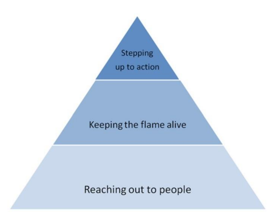
Figure 6, Guo & Saxton's pyramid model