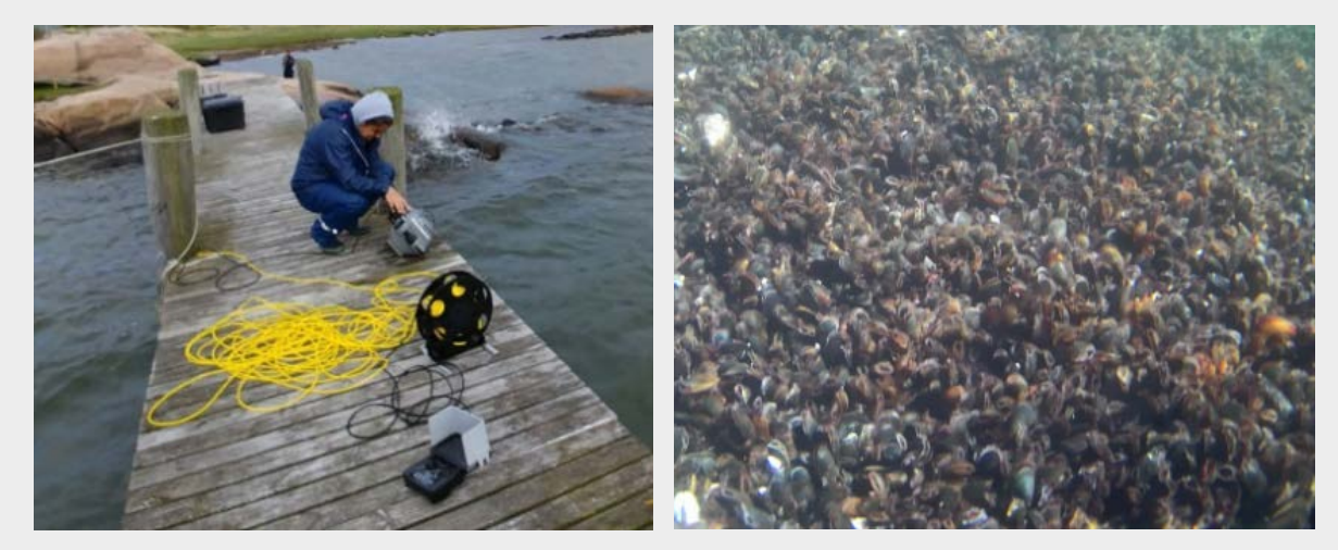
Figure 1. On the left, the preparation of the Deep trekker for operation. On the right, a picture of blue mussel bed taken by ROV in Torvastadvegen, Norway.

Overall, using ROV for mapping coastal bivalves seems to be a promising technique especially in colder seasons with fewer algae density in the area. Since this sub-project had focused only on presence/absence surveys, further studies are recommended to develop methods for using ROVs for measuring population density, individual sizes, and mortality, under varied environmental conditions.