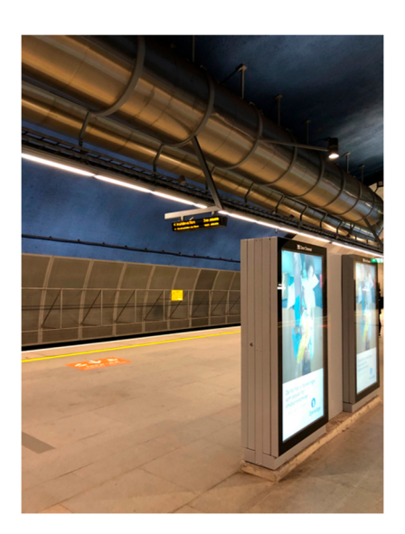
Figure 2. Example of participants' photos describing the scenery and context of transport.

Through the photos and the interview, the participants also shared individual stories about themselves. For instance, Emma took a photo of the door to her apartment and explained why.