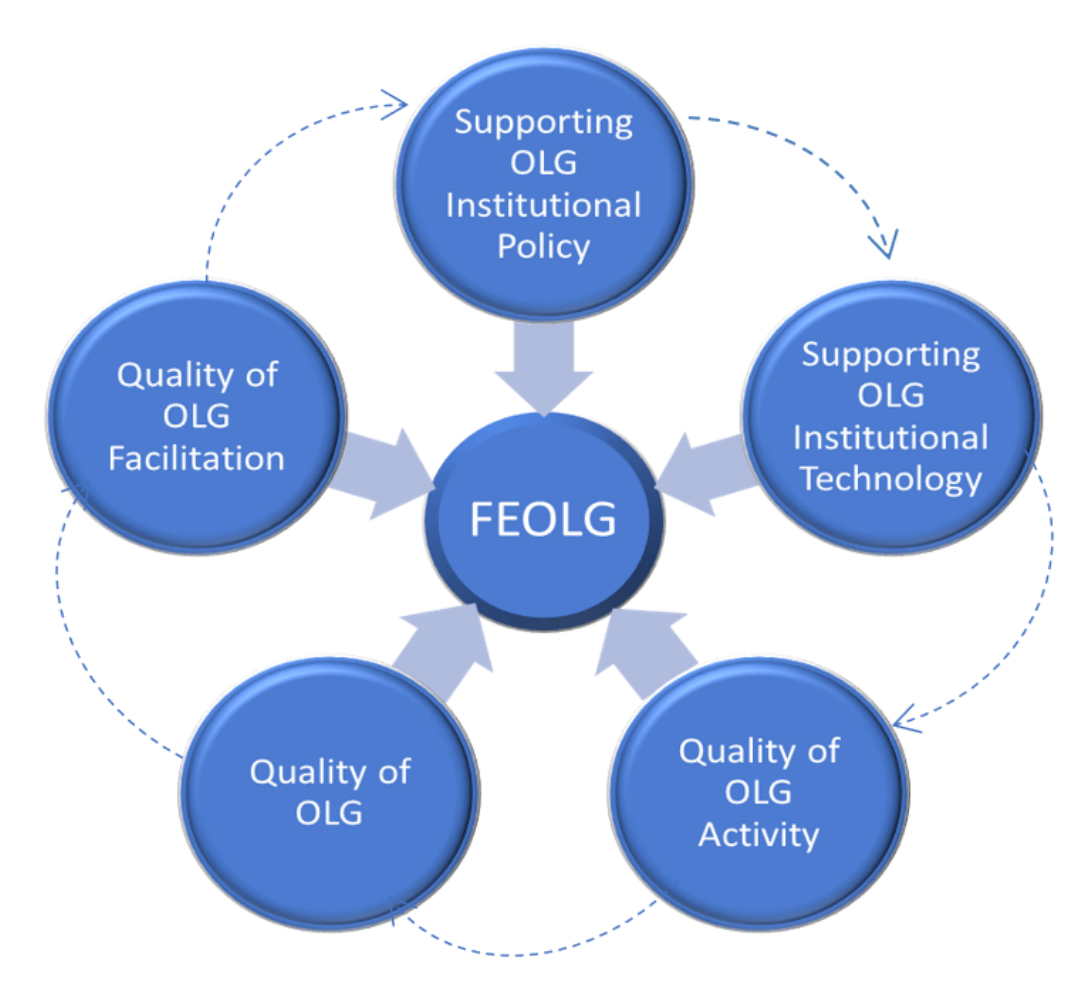
Figure F.3: Factors for effective online learning groups

in the curriculum. When such policies are not available, administering group work online becomes difficult. The facilitators at the University of Agder emphasized the need of awarding between 40% 60% on progressive assessment. This helps the students to be rewarded given the amount of work involved in the online group activity.