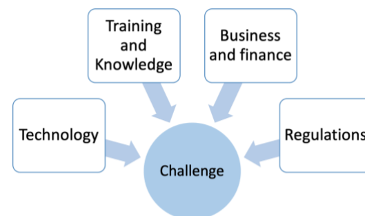
Figure 2 Challenges

Several challenges are connected to 3D printing.