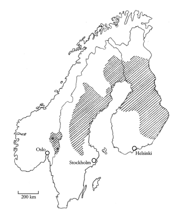
Fig. 1 The study area (hatched) and the core area (cross-hatched) in the southern part of Hedmark county, Norway, where a Great Grey Owl population was established in 2009–2011, with the pre-2009 distribution of Great Grey Owls in Sweden (Svensson et al. 1999) and Finland (Valkama et al. 2011) indicated. The two sites where data on small mammal population fluctuations were collected are marked with a dot. Data from the northern site are presented in Fig. 2a, and data from the southern site are presented in Wegge and Rolstad (2018)