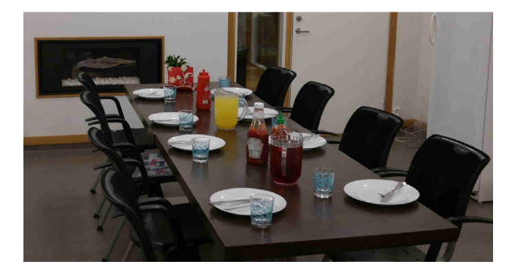
Figure 4 A dining room

Despite the benefits of being served food, one tenant criticised the practice: 'Nobody is explaining how to do it. We rather need training in household and cooking in the apartment. It is important to be seen under normal circumstances. It is not OK that people get positive