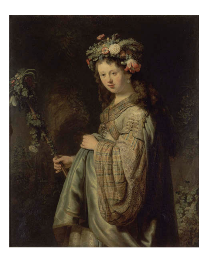
Figure 3. Rembrandt, Flora 1634, Eremitage Museum, St. Petersburg.

uses strong, clear primary colours: red, blue and yellow attract attention to the scene. The garland of flowers, the flower staff and her mantle are blurred and executed with frenzied speed. A striking difference between the two versions of the scene is how Brown lets Flora meet the viewer's gaze, whereas Rembrandt's Flora looks down with a gentle expression. Brown's Flora is a fascinating example of how an artist may refer to and show respect towards tradition, but still manage to defy it by introducing her own personal style. The energetic paint-handling and the pasty, tactile style are fully her own. It is tempting to read Flora as a self-portrait, since Brown was pregnant with her son Neri. She also stated that Flora was the name that she had intended for her child, had it been a girl (Jones, 1990, p.148). And it is also tempting to draw