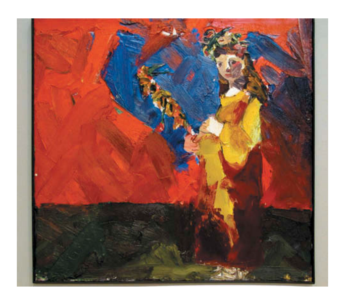
Figure 2. Joan Brown: Flora 1961.

uses strong, clear primary colours: red, blue and yellow attract attention to the scene. The garland of flowers, the flower staff and her mantle are blurred and executed with frenzied speed. A striking difference between the two versions of the scene is how Brown lets Flora meet the viewer's gaze, whereas Rembrandt's Flora looks down with a gentle expression. Brown's Flora is a fascinating example of how an artist may refer to and show respect towards tradition, but still manage to defy it by introducing her own personal style. The energetic paint-handling and the pasty, tactile style are fully her own. It is tempting to read Flora as a self-portrait, since Brown was pregnant with her son Neri. She also stated that Flora was the name that she had intended for her child, had it been a girl (Jones, 1990, p.148). And it is also tempting to draw