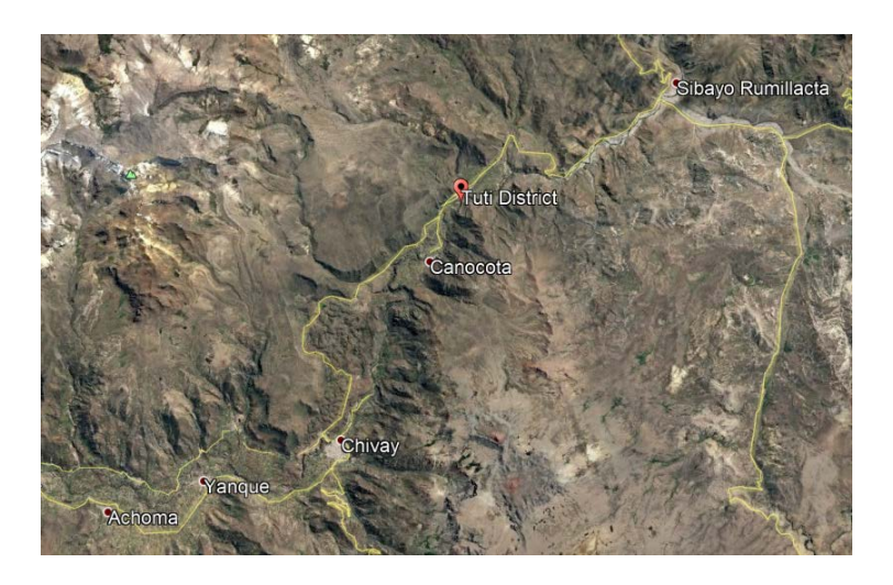
Figure 2. The villages of Tuti and Sibayo are located in the high parts of Colca Valley, 20 and 33 km from Chivay, which is the main town in Colca and the capital of Caylloma province.

Note: The villages of Tuti and Sibayo are located within the upper circle, and the town of Chivay is in the middle circle. The lower circle indicates the irrigation project in the desert pampa of Majes District, which is irrigated with water from the Condoroma Dam.