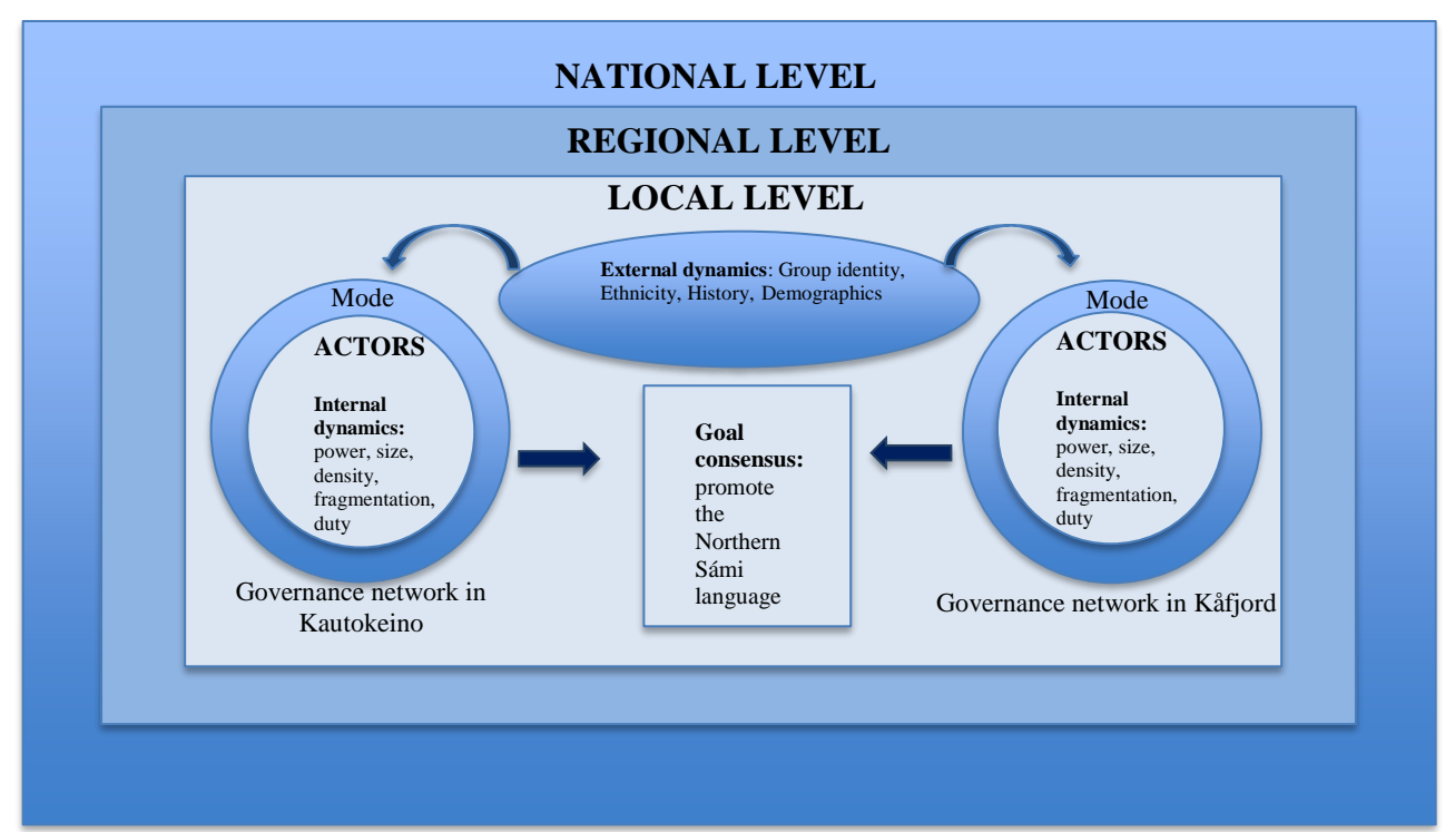
Figure 1 - Governance systems for the promotion of the Northern Sámi language in Kautokeino and Kåfjord

This section intends to condense the relevant concepts and pieces of information present in this chapter in the form of an analytical model. The image below illustrates the existence of a multi-level governance system that encompasses three governmental spheres: the national, the regional and the local level. The focal point of this system is the local layer, in which two governance networks are identified: one in Kautokeino and another one in Kåfjord. Each of these networks are steered by a mode of governance, according to the framework proposed by Provan and Kenis (2007). The focal point is the actors operating within the governance networks in the local level, which are composed by private and public organizations who interact with one another as a means to achieve a common objective: the promotion of the Northern Sámi language in the municipalities. The process that leads to this outcome is symbolized by the category entitled internal dynamics . Following the indicators introduced by Provan and Kenis (2007), it will be possible to understand how the local networks in each kommune function. These are: power, size, density, fragmentation adn characteristics of the duty (Provan and Kenis, 2007).