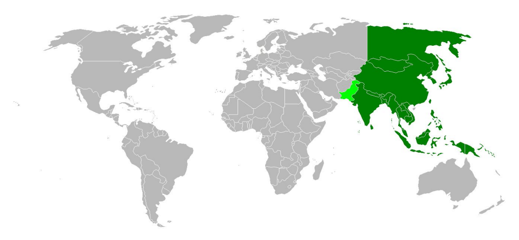
(Figure 1. Depiction of the Far East on world map. From Wikimedia Commons. Retrieved from

The striking economic growth of the Far Eastern states (China, South Korea, Japan) actualizes several problems related to understanding the results, trends and development prospects of the world community, which today is characterized by deep integration in all areas of intercultural cooperation.