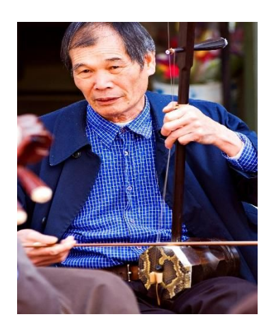
(Figure 10. Hatsun or Erhu.)

However, in the middle of the 19<sup>th</sup> century, these instruments gave way to the hatsun primacy, or erhu, to the string instrument of Central Asian origin, which began to determine the range and character of the melodies of the new genre (Provine, Tokumaru and Witzleben, 2001).<sup>17</sup> Technical vocal skill is also subject to certain canons. According to the manner of performance, the Chinese theory distinguishes two schools of vocal art: Xiong (courageous, heroic) and tsy (feminine, elegant). For the first school there is a characteristic melodic pattern of vocal parts and a clear pronunciation of each hieroglyph; for the second - subtle intricate weaving of a melody with characteristic glissando and vibrato. Of importance in vocal mastery is articulation.