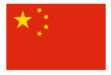
(Figure 2. Flag of China.

Worldview and sociocultural basics for the forming of professional musical culture in the countries of the Far East and its features.