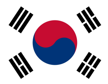
(Figure 3. Flag of South Korea.

)