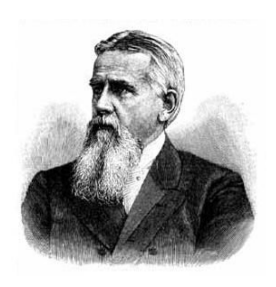
(Figure 11. F. Ratzel.)

The founder of diffusionism was a German researcher Friedrich Ratzel (1844 - 1904) (Mathur, 2018).<sup>2</sup> The main ideas of diffusionism can be considered legitimate and productive, since diffusionists raised the question of concrete historical ties and mutual influences of cultures of various peoples. In the studies of diffusionists, the methods of analysis, comparison, searching for similar moments in the parts that make up culture were worked out. Diffusionists explored the issue of spatial and temporal characteristics of cultures.<sup>2</sup>