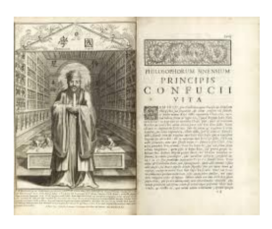
(Figure 5. Illustration of Confucius in a book. From Wikimedia Commons. Retrieved from <a href="https://commons.wikimedia.org/wiki/File:LifeAndWorksOfConfucius1687.jpg">https://commons.wikimedia.org/wiki/File:LifeAndWorksOfConfucius1687.jpg</a>. Copyright (1687) by Philippe Couplet.)

outside of philosophical and ideological problems. Philosophical schools in China began to take shape by the middle of the first millennium BC.<sup>2</sup> These schools would teach ideas, epistemology and ontology in accordance with its primary philosophical roots. Among the teachings that have had an impact on the formation of all areas of Chinese culture, the most important are Confucianism and Taoism. Each of them covered its own area of concern. At least that is one way of looking at it.