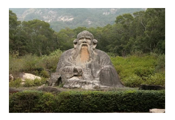
(Figure 6. Massive Lao Tzu statue.)

At the turn of the 6<sup>th</sup> - 5<sup>th</sup> centuries B.C. in China, another major philosophical and religious doctrine emerged that determined the future image of Chinese culture, Taoism. Its founder is said to be the sage Lao Tzu (4<sup>th</sup> - 3<sup>th</sup> century BC).<sup>3</sup> The main category in this teaching is Dao, which literally means the way. Which is quite fitting as we are considering an ancient philosophy, specifically designed to lead man to the true "way" of life.