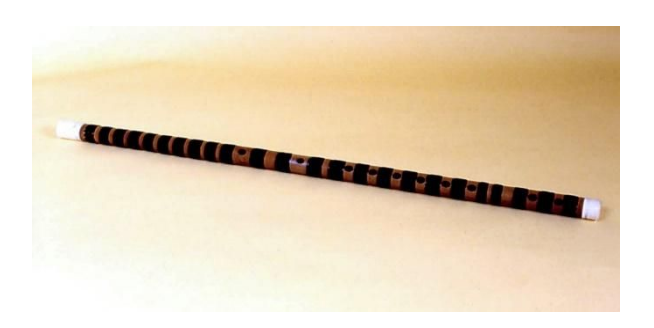
( Figure 8 . Flute, dizi.)

A distinctive feature of the Peking Opera orchestra is the abundance of percussion instruments (cymbals, castanets, drums and gongs) that create an atmosphere on the stage of festivity of folk street performances. They subordinate the actor's movement and the staging of the performance to a precise rhythm. The orchestra is controlled by a drummer who extracts with the help of bamboo sticks a variety of sounds that express the feelings of the heroes in exact accordance with the acting. In the orchestra of the Peking Opera, the specificity of the instrument's sound determines the range of performed instruments.<sup>16</sup>