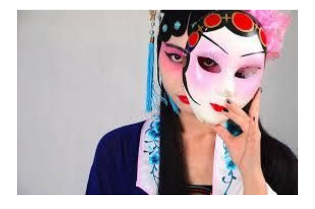
( Figure 7. Chinese Peking Opera woman.)

In the history of the Chinese theater, several stages are known, which are determined by the time of the rule of individual dynasties. So, fame got: Sung Theater is a Song-period theater (920-1279), represented by comic, "mixed performances," in which five actors took part, not counting dancers and musicians; The Yuan Theater is a theater of the Yuan period (1271 - 1368), known as the "Yuan drama"; the Minsk theater is the theater of the Min period (1368 - 1644). Each stage is characterized by its own form of drama and techniques of stage expressiveness(Provine, Tokumaru and Witzleben, 2001). 15