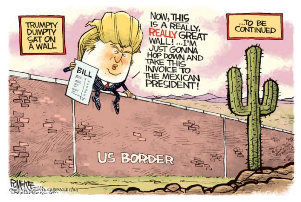
Fig. 1. Donald Trump's Wall

The first task shows that Trump's wall is apparently well known to the pupils. They comment on how Trump resents all Mexicans, except his gardener and on how he claims that all criminals come from Mexico. But perhaps most interesting, they are able to compare this situation to the Berlin Wall, North and South Korea and the situation in Europe where borders are closed, and Syrian refugees (amongst others) are shut out. As an additional objective, 10 is inserted (see table 1 p. 19-21). To fulfill this objective, the learners must show that they have the pre-knowledge required to identify a relevant conflict, and that they are able to compare it to other conflicts relevant to the literary text. Here is a part transcribed from the first lesson: (All grammatical errors are kept authentic.)