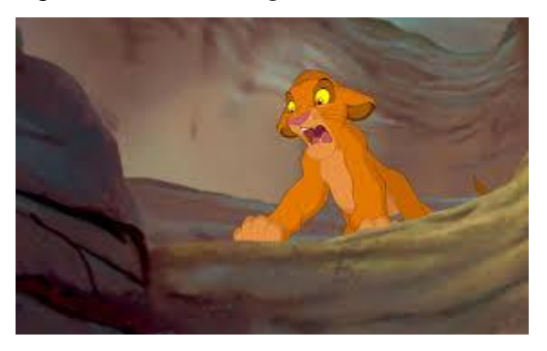
Fig. 4. "Simba" The Lion King