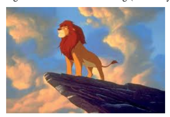
Fig. 5. "Simba in The Lion King takes over Pride Rock" (Mirror.co.uk)

Figure 1 shows the tight relationship between father and son. Figure two shows how Zimba, as a child, is left to manage on his own when his father dies. Figure three