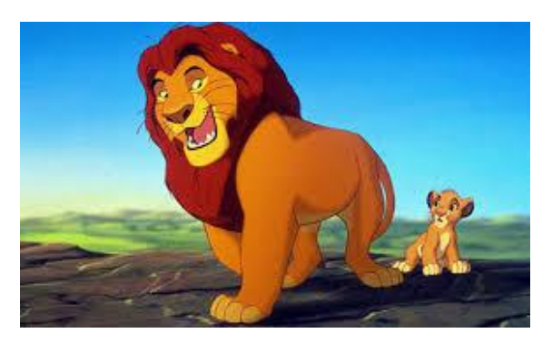
Fig. 2. "Mafusa and Simba" The Lion King