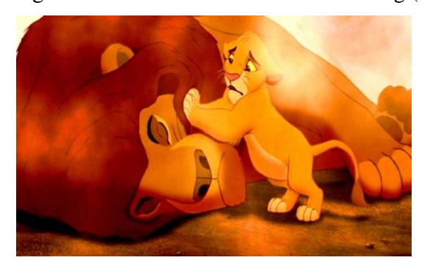
Fig. 3. "The harrowing moment Mufasa died" The Lion King