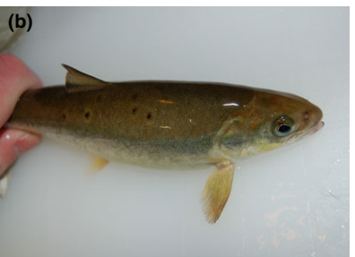
Figure 1 Distinct pigmentation profiles in Atlantic salmon defined as (a) 'spotted', that is, stress resistant and proactive and (b) 'non-spotted', that is, stress sensitive and reactive. Reproduced with permission from Kittilsen et al. (2009b).