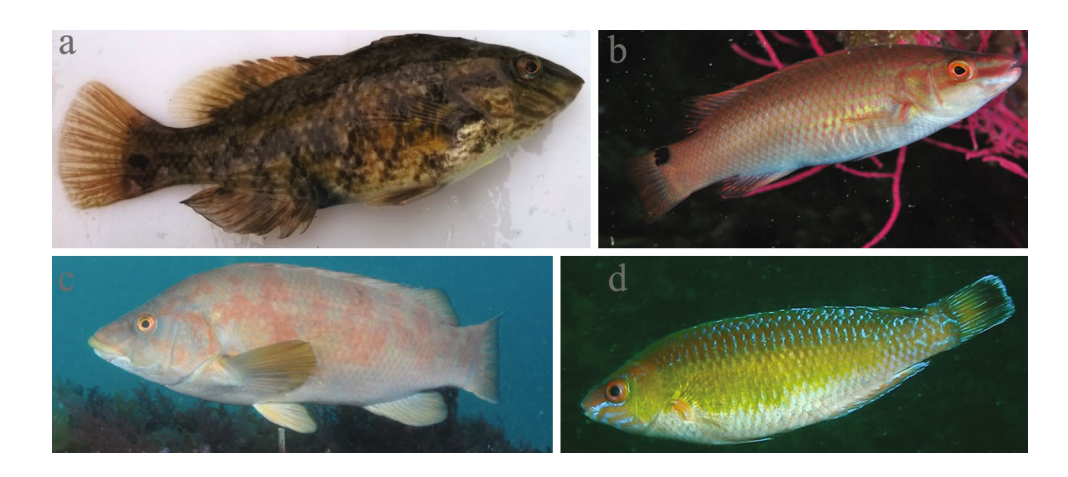
Fig. 2 Wrasse species used as cleaner fish in the Norwegian salmon aquaculture. a female corkwing Symphodus melops , b goldsinny Ctenolabrus rupestris , c ballan Labrus bergylta , d rock cook Centrolabrus exoletus

Corkwing wrasse (Fig. 2a), known as grønngylt in Norwegian is, together with goldsinny, the most abundant cleaner wrasse species used by the Atlantic salmon farming industry in Norway (Fig. 1b). It can live nine years, attain 28 cm in total length and reach maturity after 1-3 years [27, 30]. The species display sexual size dimorphism with nesting males being significantly larger in total lengths than females and sneaker males [42, 43]. These differences in sexual size dimorphism were especially remarkable in specimens collected from the west coast of Norway, and it has been ascribed to a delay in maturation and faster growing of nesting males with respect to females and sneaker males [42]. The phenotypic differences observed between corkwing wrasse populations inhabiting the western and the Skagerrak coast of Norway are in agreement with recent genetic data evidencing sharp regional differences [44]. Blanco Gonzalez et al. [44] suggested the presence of unsuitable sandy areas for reproduction and oceanographic factors as major barriers for population connectivity in this species in Norway.