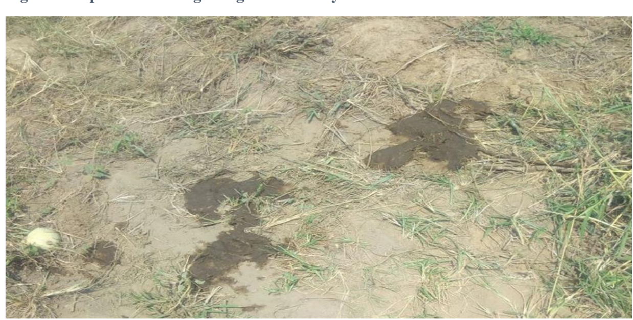
Figure 8: A picture showing overgrazed land by cattle

The main natural effect as a result of the pastoral activities in Agogo is soil erosion and desertification of the lands. Due to overgrazing by the cattle and frequent bush burning, the forest nature of Agogo lands are gradually turning into desert. The veterinary doctor explained that, Agogo was a thick forest in the 1970s, 1980s and 1990s. However, the influx of the herdsmen and their cattle is gradually turning the place into desert. The chief of Bebome village indicated that, the constant bush burning by the Fulani herdsmen turned the forest into grassland. And now, overgrazing by the cattle is gradually turning the place into desert land.