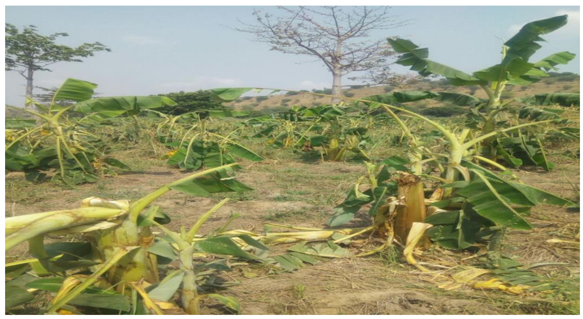
Figure 1: A Picture of a plantain farm destroyed by cattle