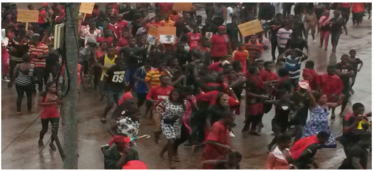
Appendix 13: A picture showing a demonstration by AgogomanMma kuo &youth association