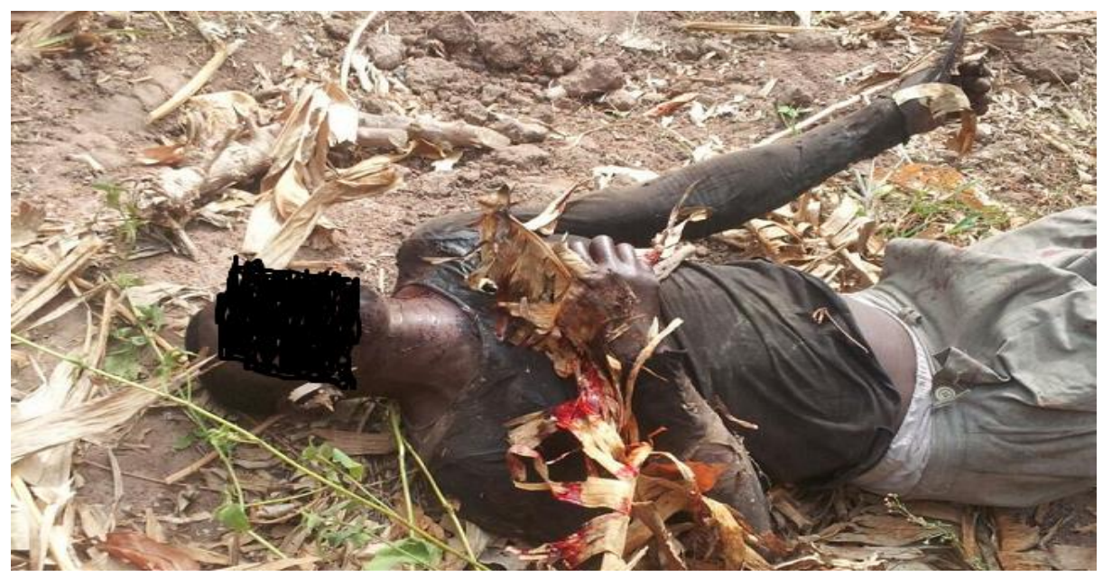
Appendix 16: A farmer killed in his farmer

Source: Agogo District Police Station (Fieldwork 2017)