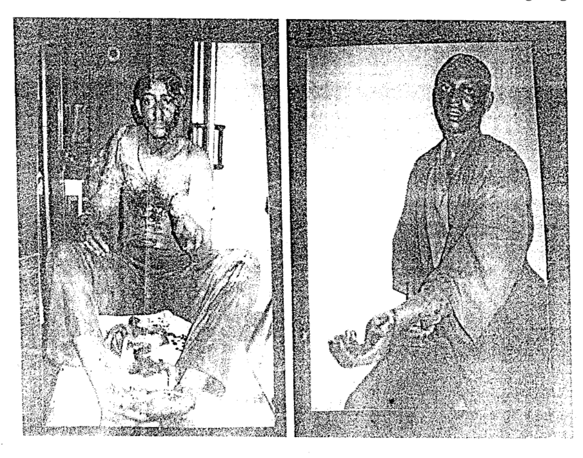
Page 7 of 46