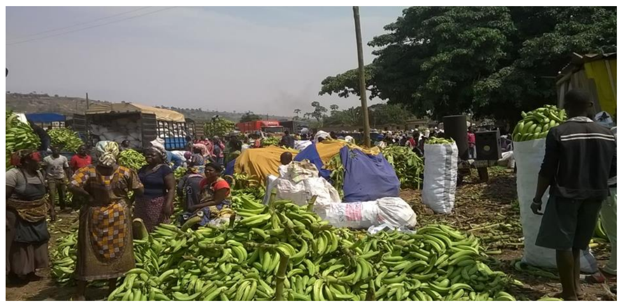
Appendix 12: A picture showing harvested plantain at Agogo market