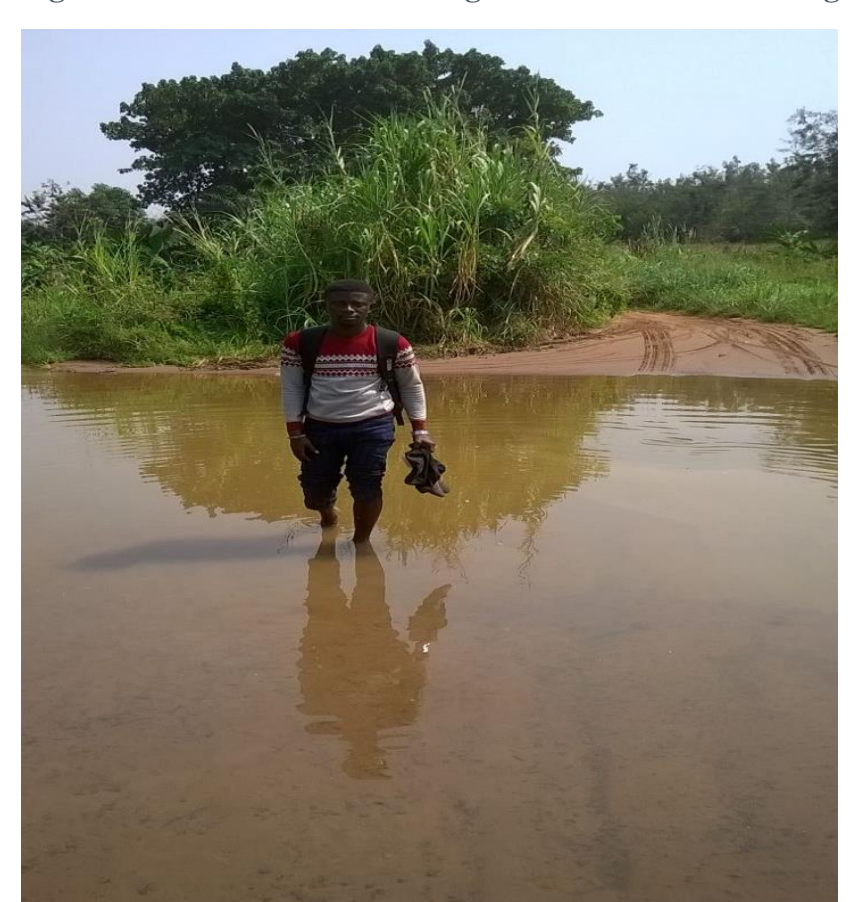
Figure 6: The researcher crossing a stream to Bebuso Village

Finally, the poor road nature to the villages. The deplorable and dusty roads linking the villages posed serious health problems (catarrh, incessant coughing) for the researcher. At times, the researcher had to walk several kilometres, crossing streams to some areas.