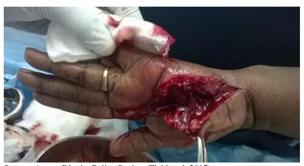
Appendix 15: Another farmer who sustained cutlass wounds