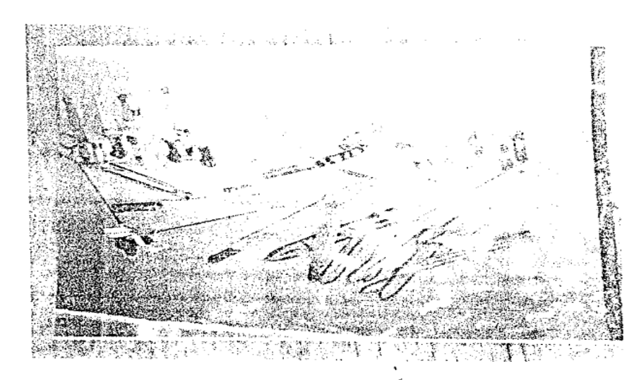
Fig. 2&3 Two Fulani herdsmen who inflicted cutlass wounds on each other whilst fighting