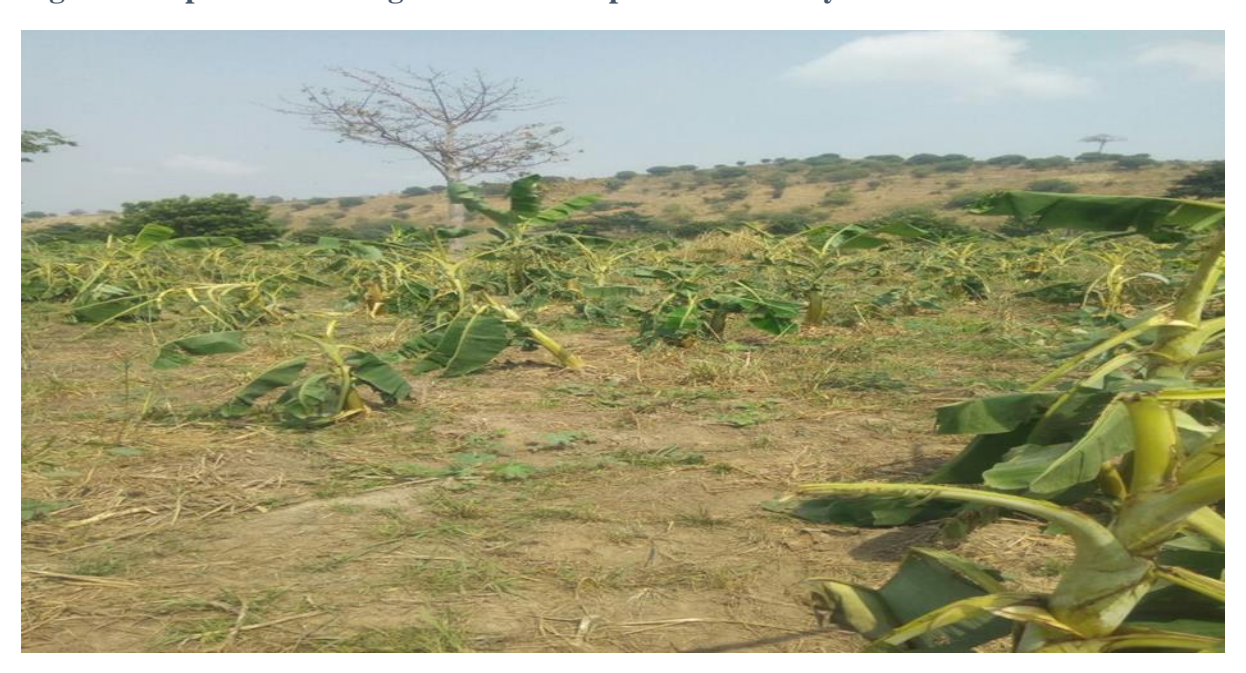
Figure 7: A picture showing destruction of plantain farm by cattle