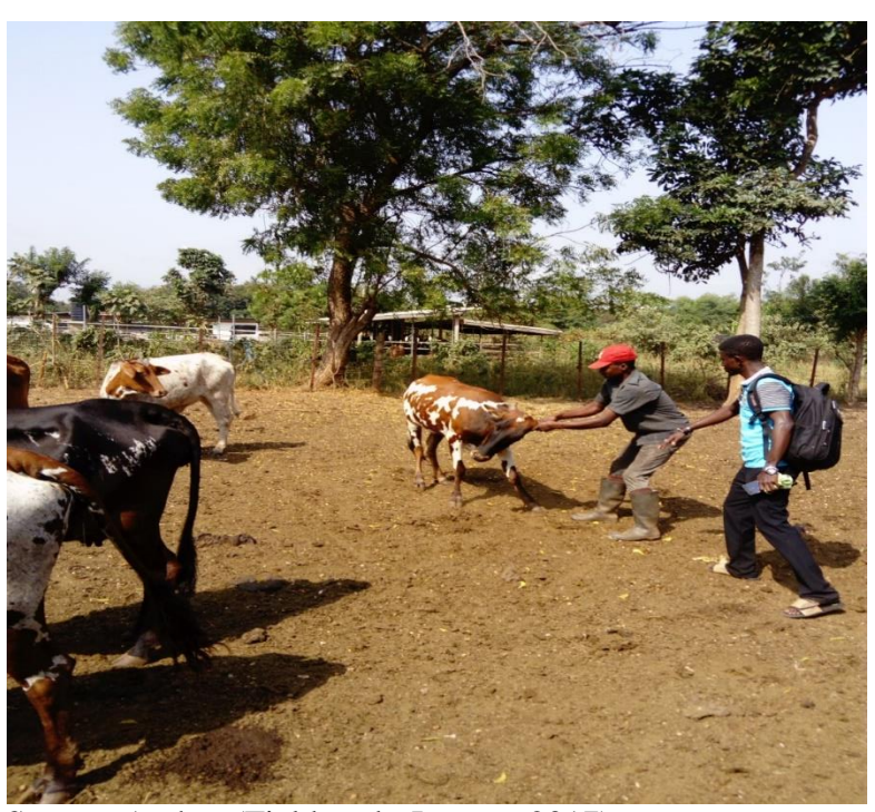
Figure 4: A picture of the researcher and a herdsman during an interview