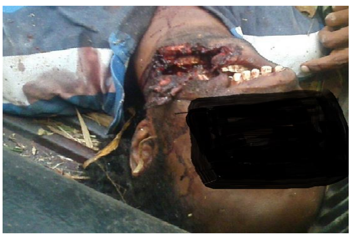
Appendix 17: Another farmer killed in his farmer