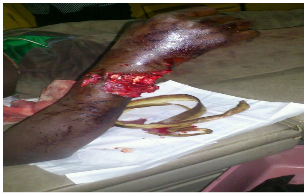
Appendix 14: A farmer who sustained cutlass wounds