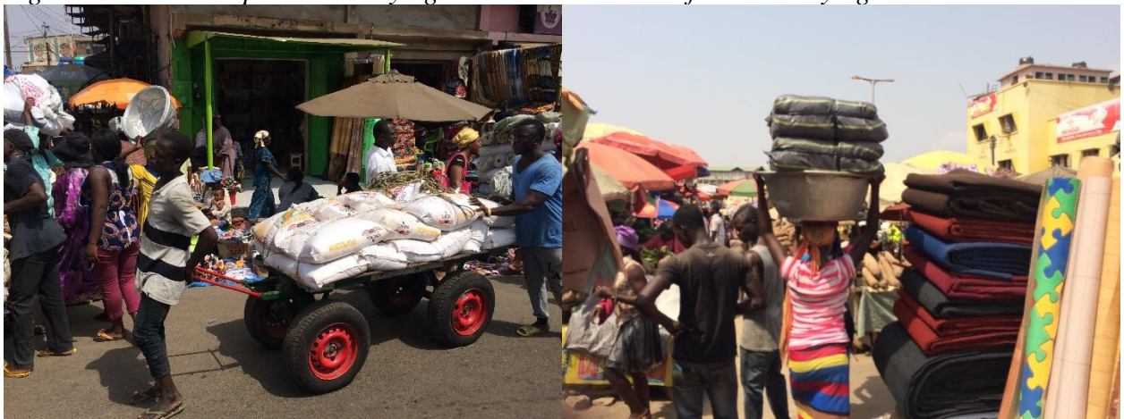
Figure 4:Male truck pushers carrying loads on truck and a female carrying load on her head

trucks and motor kings, while female porters carry smaller loads of petty traders and travellers in pans on their heads.