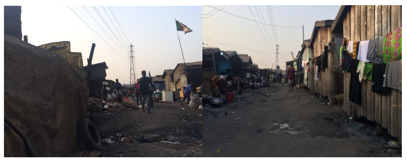
Figure 3: Sections of Aboabo that acts as a place of work and residence for the migrants

Most of the houses are constructed with wooden structures as a result of the fear of eviction because the dwellers do not enjoy security of land tenure. In other words, the dwellers of Aboabo fear to lose their housing investments in times of demolition exercises or when the railway lines are reactivated, hence prefer to live in the wooden shacks. This confirms the statement that slum areas with no security of land tenure have most houses built with inferior materials hence, poor structural quality of housing (UN-HABITAT, 2006).