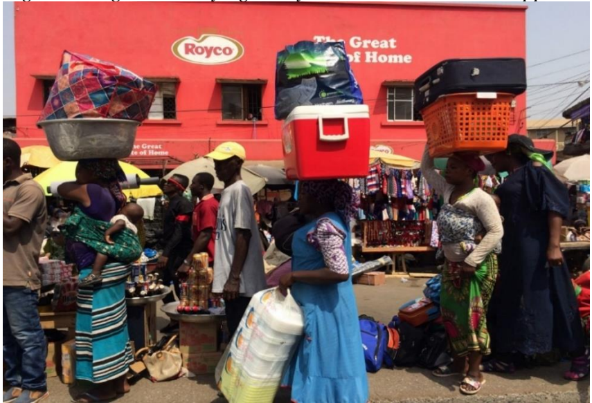
Figure 6:Migrants carrying heavy loads with children strapped to their backs