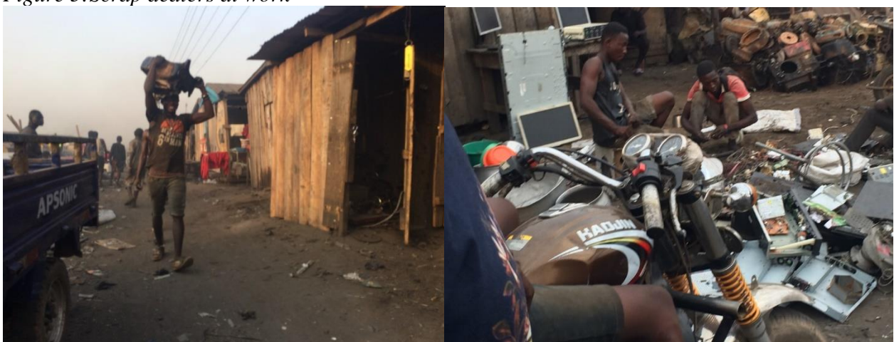
Figure 5:Scrap dealers at work