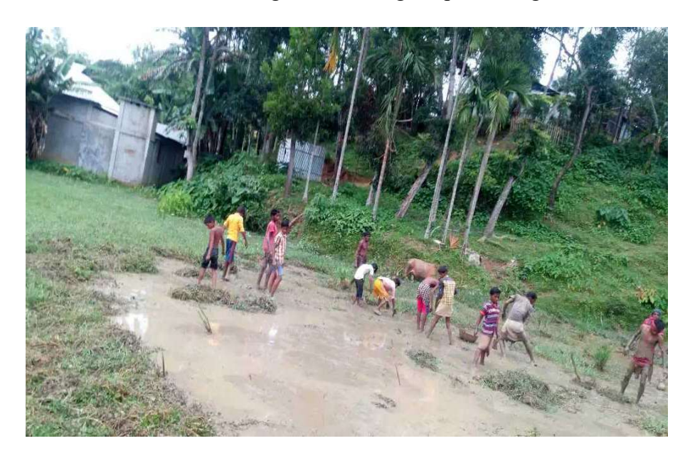
Picture: The children of tea labors are preparing the paddy land for rice cultivation