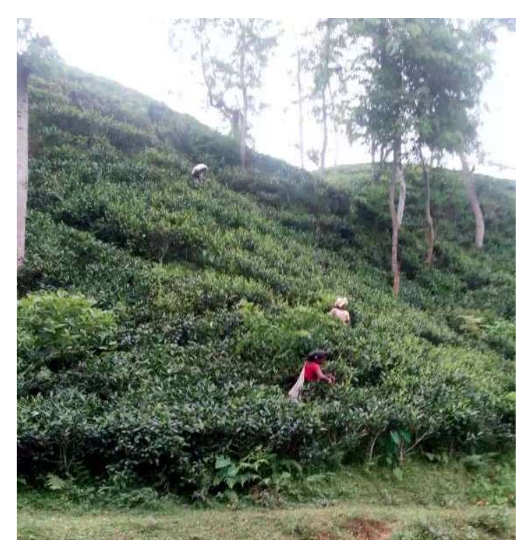
Picture: Women tea plucker are working in their duty place in the slopes of hillocks