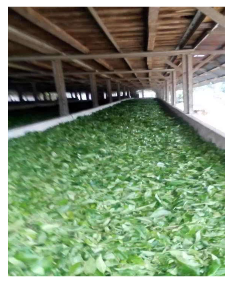
Picture: Green tea leaf are in the big bowl waiting for processing inside the tea factory