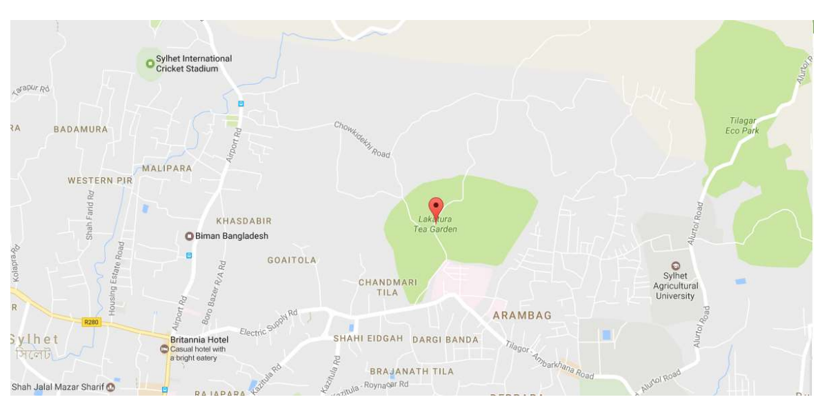
Figure 2: The location of research tea estate