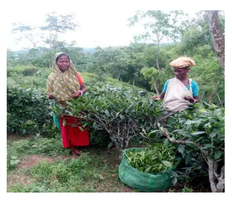
Figure 7: Female tea labors in their duty place