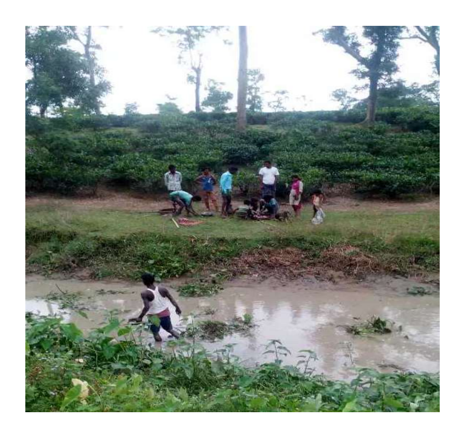
Figure 4:Tea labor Catches Fish for Subsistence