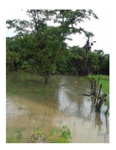
Picture 3.1. The floods in Oddusudan, Mullativu (Photo taken by the researcher, 2015)

Picture 3.1. shows the difficulty of walking in the Vanni area for data collection because of the floods. The researcher used the Three–Wheeler or Tuk-Tuk to avoid the difficulty of walking through the floods when accessing some places in the Vanni area. The Three-Wheeler cost some money and it was difficulty finding Three-wheelers.