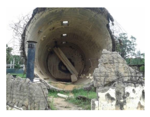
Picture 2.4. The Water Tank- A symbol of the war destruction in Kilinochhci

The Picture 2.4. of the destroyed big water tank in the middle of Kilinochchi city center demonstrates the destruction of the LTTE and it condemns the rebirth of the terrorism. However, it encourages the revenge of the Sinhala community over the Tamil community as they