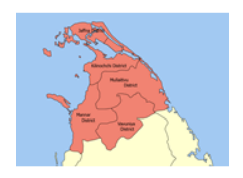
Map: 2.2. The Vanni Area in Details: Vanni is a collective term for five districts, Jaffna, Killinochchi, Mullativu, Mannar, and Vavuniya