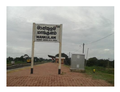
Photo 2.3. Rail way from Colombo to Jaffna.

Photo 2.3. has been taken at Mankulam train station in Mullativu, 2015. It is a sign of the Northern railway life of Sri Lanka that erupted on 1990. The train that went from Colombo to Jaffna on 13 June 1990 could not return to Colombo till early 2015 because the LTTE set off explosion and caused destruction to the Northern railway track and train station. The reconstruction project of the GOSL has rebuilt the Northern line with the collaboration of India which is providing technical knowledge and financial assistance. The reconstructed Northern railway indicates the unification of North and South and it makes the everyday transport easy and brings normal life to the war affected communities.