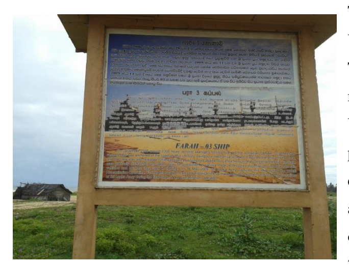
Picture 2.6. The War memorial Plaque in Vellamullivikka, Mullativu

This Picture was taken in Vellamullivaikkal, Mullaitivu in 2015. The memorial plaque informs about the military power in the Vanni area. Vellamullivaikkal is the geographical place where the civil war of Sri Lanka came to end. Thousands of people died and got seriously injured in the last stage of the civil war (The United Nations, 2011). However, there is no single