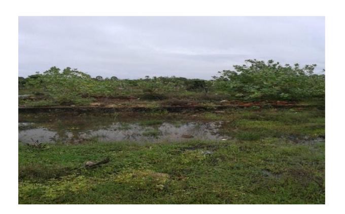
Picture. 5.2. The foundation of bulldozed house in Mullativu (Picture has been taken by the researcher, 2015)

"My house has been bulldozed by the Sri Lanka army in 2009. It is not just a house. It is a house with a lot of good memories. I and my husband worked so hard to build this house. The army just bulldozed it. The army said that the house should be demolished to clean the area from the land mines. I did not get any compensation for my bulldozed house" (Female, K)