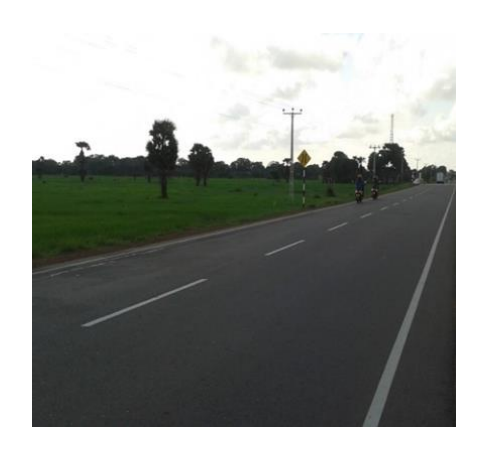
Picture 2: 1.The Kilincochi- Mulativu road (A-35)

Infrastructure Development in the Vanni area