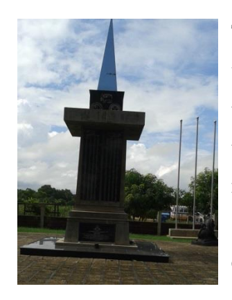
Picture 5.1. The memorial tower of the army in Mullativu city centre.

The memorial towers of the Sri Lanka army are the main symbolic violence in the Tamil community. The women said that before 2009 the Mullativu area was full of the memorial towers of the LTTE. Now the area is filled with the memorial towers of the Sri Lanka army. The memorial towers of both the Sri Lanka army and the LTTE are symbolic violence which restricts their freedom to have a normal everyday life with freedom to move and to act. The Picture 5.1.