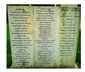
Picture 2.5. The war memorial plaque in Kilinochchi

It is contradiction to define Kilinochchi as a city of peace when there is symbolic violence and military present in the city. It is contradiction to define Kilinochchi as a city of peace when there is symbolic violence and military present in the city.