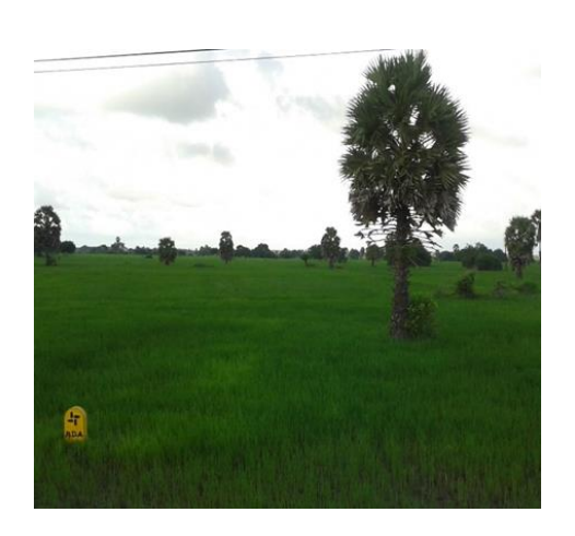
Picture 2.2. Green paddy field in Killinochchi

development in the war affected communities. The green paddy field represents the reviving of normal work in the war affected communities. The two Pictures are parables of moving the war affected areas and communities towards the normal everyday lives associating the government reconstruction and recovery projects.