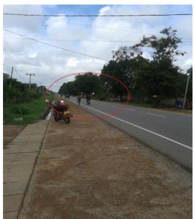
Picture 5.3. The army intervening in vehicle collision

The army has checked the Dharampuram village, in Kilinochchi, three times a day. The army soldiers with weapons ride on the cycles around the village. It signifies that the army is watching the people every day.