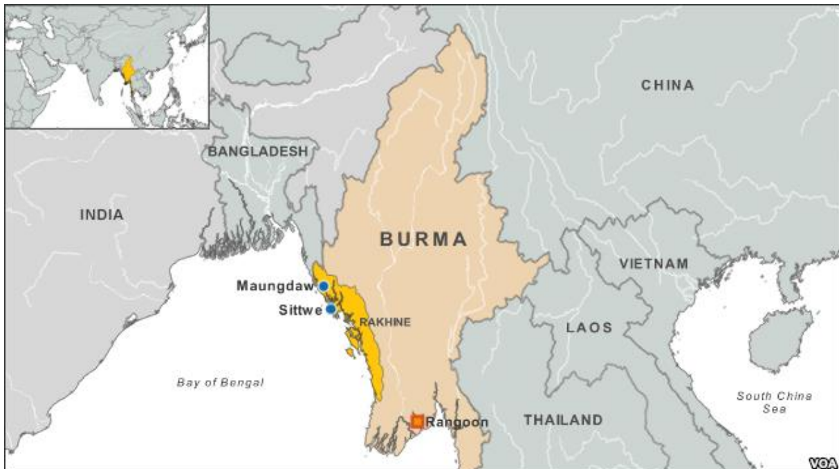
Figure 1: Map of Myanmar, showing the location of Rakhine (VOA, 2012)

Myanmar stretches over an area of 653,407 square kilometres and is populated by around 54 million registered citizens of 135 different ethnic groups. The country, formerly known as Burma, is situated between two Asian giants, India and China. It shares borders with Bangladesh, Thailand and Laos, in addition to bordering three giant oceans; the Indian Ocean, Bay of Bengal and the Andaman Sea. The Rakhine state is located in southwestern Myanmar, along the coast of the Bay of Bengal, and the region is isolated from the rest of the country by a wall of mountains with several names; The Arakan Yoma, the Rakhine Mountains or the Arakan Mountains. It stretches from Naf River on the border of the Chittagong Hills area of Bangladesh in the north, to the Gwa River in the south (Britannica, 2016a). The state was previously named Arakan, but was in 1989 changed by the ruling military dictatorship called the military junta, as Burma became Myanmar. As Rakhine stretches along the coast between the rest of Myanmar and the Bay of Bengal, most of Myanmar's offshore petroleum region is thereby occupied by the Rakhine Basin. It covers an area of 170,000 square kilometres and extends onshore beneath the Rakhine Coastal Lowlands as well (Racey and Ridd, 2015:93).