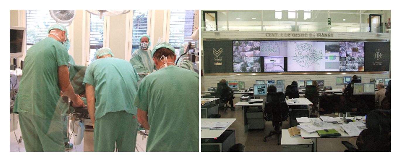
Fig. 3 Critical infrastructures like the health and transport sector could be early adopters that may benefit from using privacy-enhanced intrusion detection systems

demonstrate the possible synergies that can be achieved between privacy and security objectives, in order to convince MSS providers that there is a real benefit—also from a security perspective from using such technologies. There are already legal incentives for using such technologies in some areas, for example for health institutions or critical infrastructures which by definition handle confidential information. This means that there already probably is a market for privacy-enhanced intrusion detection systems, although it currently is not very large.