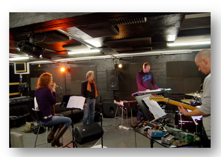
Artist, producer, keyboardist and guitarist in the rehearsal room (the bass player and drummer, present at the time, do not appear in this photo)

The ethnographic settings are three separate locations in Oslo: 1) A rehearsal studio, 2) Musikkloftet recording studio, and 3) Fersk Lyd recording studio. The rehearsal studio is a rented ensemble room with amplified live sound and monitors. This is where the artist and the band rehearse and discuss the material for the album. Sometimes the producer joins the musicians and contributes his ideas, but, at this stage, there is no need for the sound engineers.