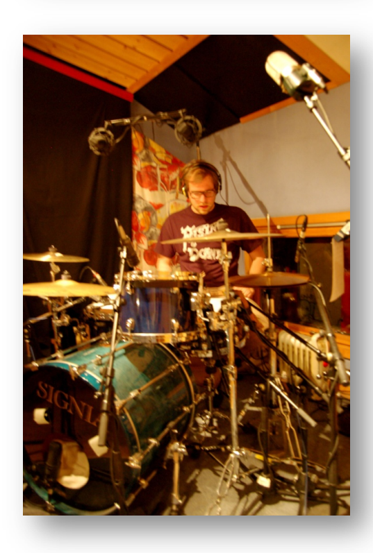
Photo above: the control room (sound engineer and producer) Photo below: drum booth (drummer)