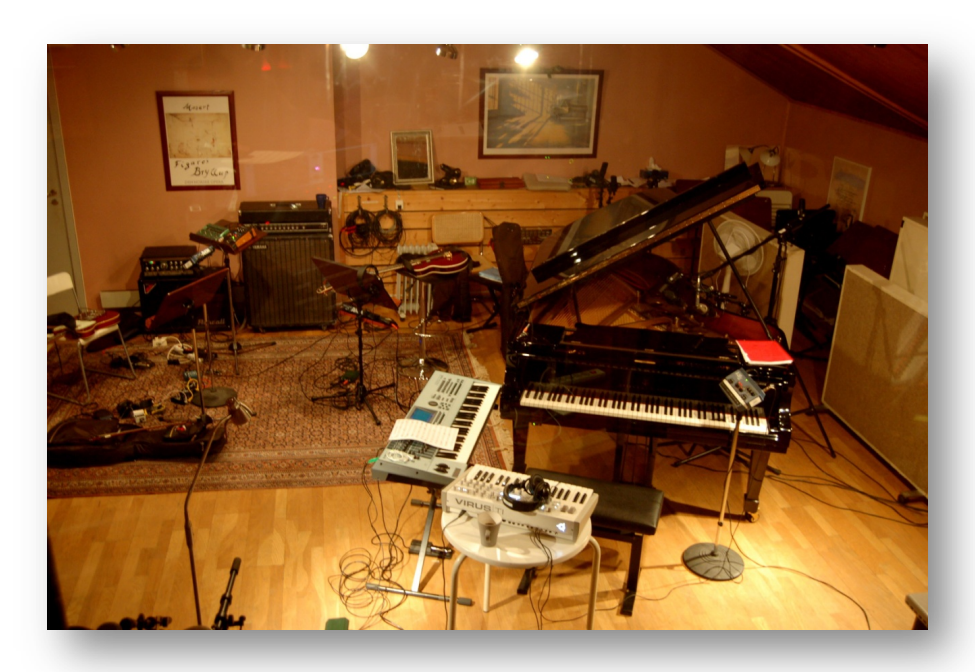
Main recording room (grand piano, keyboards, bass, guitar)

The rest of the time is spent in two different professional recording studios. The first session was recorded at Musikkloftet Studio, and the second at Fersk Lyd Studio. The photographs below were taken at Musikkloftet Studio: