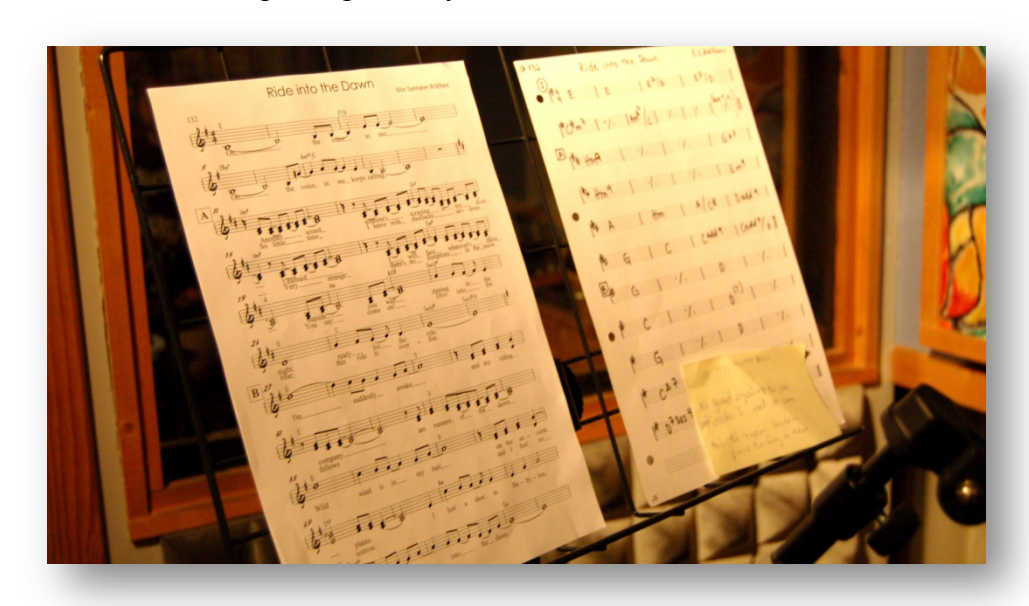
Two different versions of the music sheet for track no. 3

interpretative scope by looking into the implied meanings of a flux of metaphoric linguistic expressions. In other words, this project goes beyond the denotative meaning of a word you can look up in a dictionary. We could almost talk about this layer of codes as a figurative "meta-language" that linguistically follows the rules in the way that words are inflected, phrases are structured and sentences are built, but with its own specific set of meanings and connotations determined by a small group of people; in this case the participants in the current album-recording. This product of figurative creativity between "insiders" generates a system of verbal codes with a certain group-specific meaning. This task touches upon semiotics<sup>22</sup> insofar as it shows the production of meaning from a relationship between sign-systems (linguistic and non-linguistic); "musicspeak" is sometimes linked to the non-linguistic sign-system of "the music sheet" (or "music chart") – music denoted by chords, notes, expression symbols, etc.; basic information handed out to session musicians. However, I have not made semiotics an issue requiring in-depth source studies because, linguistically, the research task revolves around what the participants say.