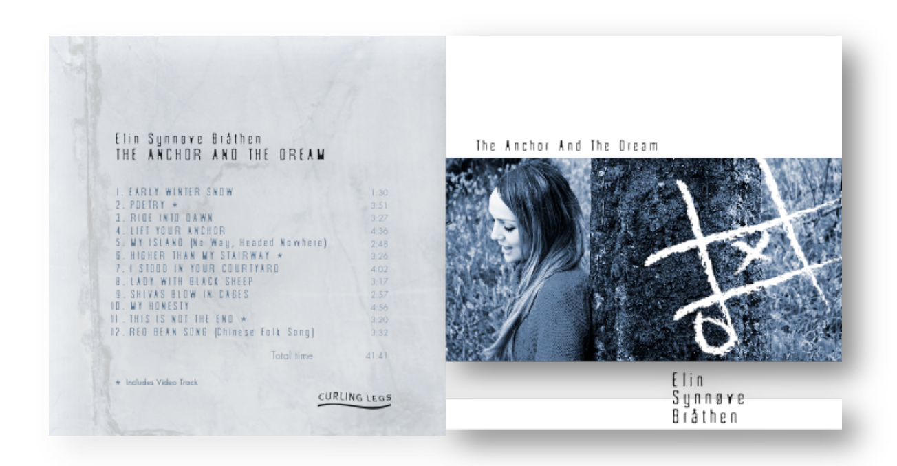
Cover-image (back & front) of the album The Anchor and the Dream

As an indication of the genre of the album I quote from some of the published reviews. A London music critic, writing in the newspaper The Irish World , says: "...this wonderful collection of songs, mixing as it does elements of Pop, Jazz, Rock, Celtic and World music." Another reviewer wrote: "The vocalist and song-smith (...) has developed the music into a unique mix of pop, rock, jazz and world music." A Norwegian online magazine reads: "It is not purely a jazz-album, but more a mix of different styles. (...) Vocally she reminds me of Kate Bush and Tori Amos (...)." Music critic for the respected Norwegian music magazine Puls , Arild Rønsen, calls it: "... a tasteful mix of jazz and pop." These are just a handful of the reviews published in foreign and Norwegian magazines and newspapers. Some highlight the Celtic or World inspiration and others label it "pop music with a jazz flavour"; however, all agree that my music represents a "mixture of popular music genres."