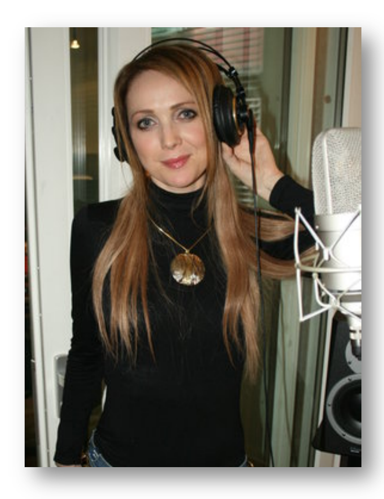
Artist in vocal booth (Fersk Lyd AS)

Here again, the vocalist was placed in a separate and sound-proof booth, recording the vocals through a live (open) studio microphone, wearing headphones to hear playbacks of the tracks, to monitor the live vocal sound, and to communicate with the producer and sound engineer in the control room. Communication between the vocal booth and the control room is regulated by a function called "talkback." The vocalist can only speak to the producer and sound engineer if this function is activated. If the "talkback button" is active the vocalist can hear what the producer and sound engineer are saying but cannot be heard by them, and is therefore unable to interact with them, something which obviously affects the total dialogue-structure.