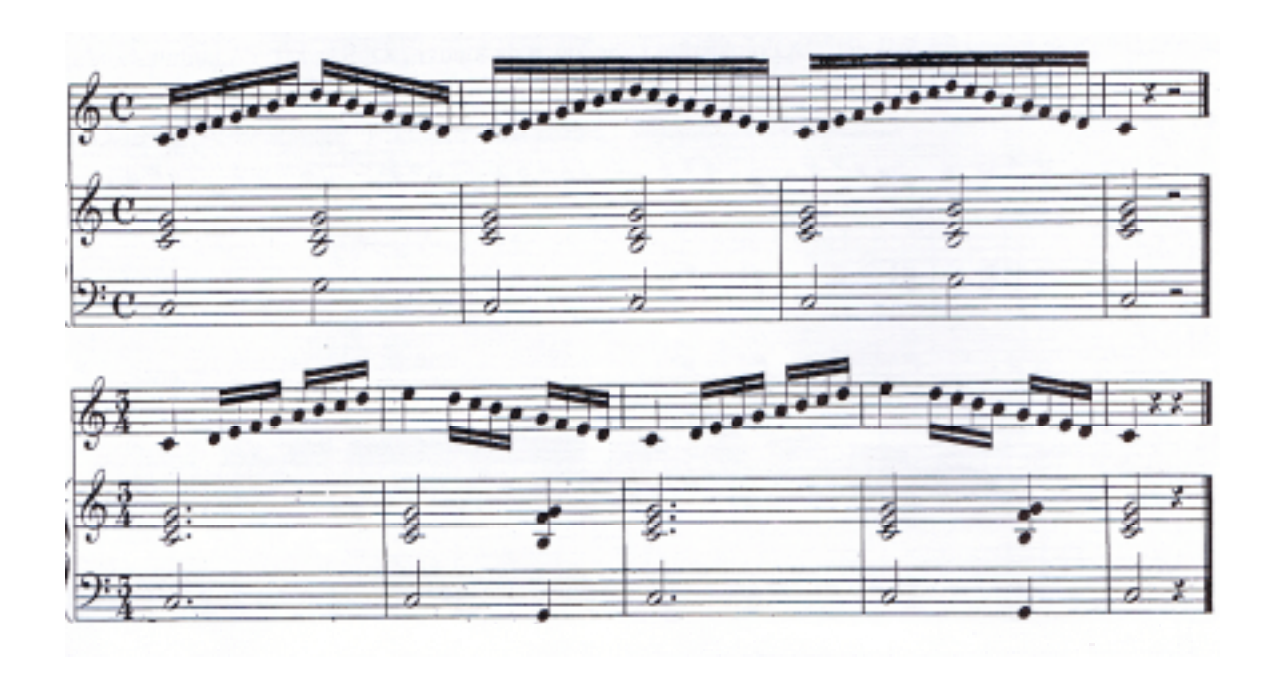
Example nr. 3

I begin this exercise slowly and then get faster and faster while singing on the breath but not with a breathy emission. I open my throat and try to feel the sound spinning in front of the mouth. It helps too to think about the placing of the tone near the brow and in the cheek bones in this exercise. The other example is faster and more complex which helps to stretch the voice and make a good connection between the registers and also encourages a good legato sound.