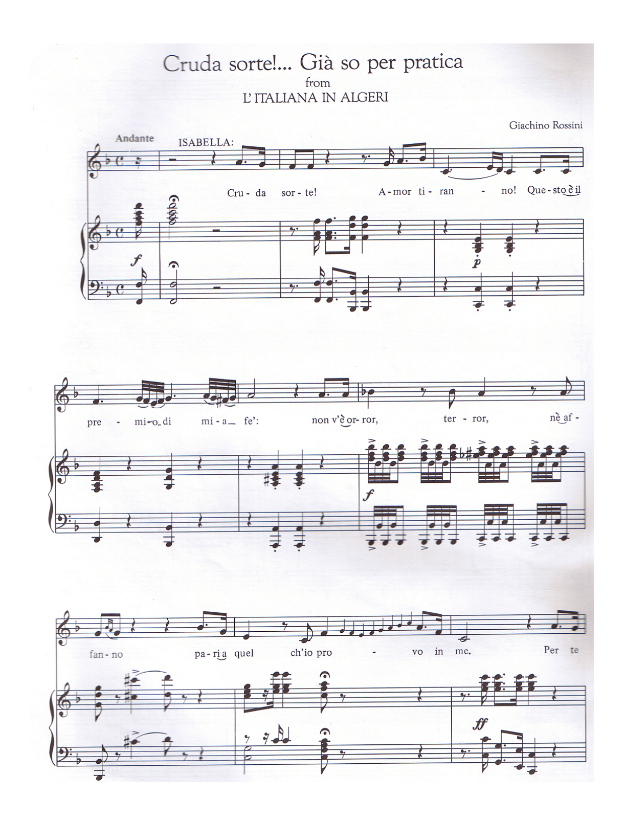
Example nr. 7

I have to say that if I make this first part of the aria with dark timbre or if I push my voice, and I do it sometimes because of the text, it could be difficult to make a bright and open sound in the other section. So we should be very clever sometimes giving ourselves to the music, because it can be bad reflected on the voice. This Isabella emotion is deep and we should sing it like we really fell it.