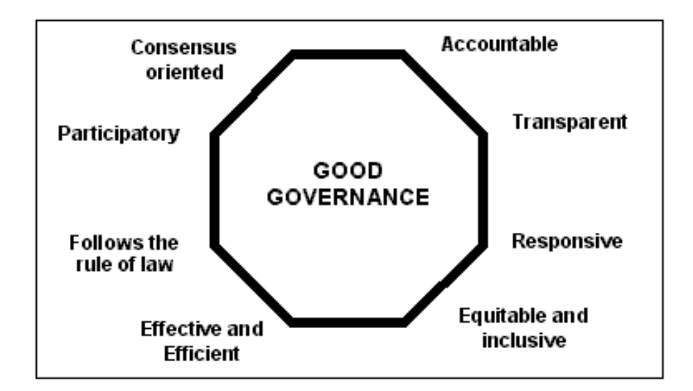
Figure 2. Charateristics of good governance (Ibid.)

Good governance thus requires the existence of checks and balances (horizontal accountability), participation and elections (vertical accountability), and respect for basic human rights (which include political rights). In what form and to what degree these criteria will have to be satisfied for a system of governance to be 'good' is a moot point. It is for instance possible that authoritarian governments can pursue sound development policies, especially when defined as economic growth (with China being the prime example), and foreign policy makers and donors can sometimes play down the issue of democratization for political reasons.