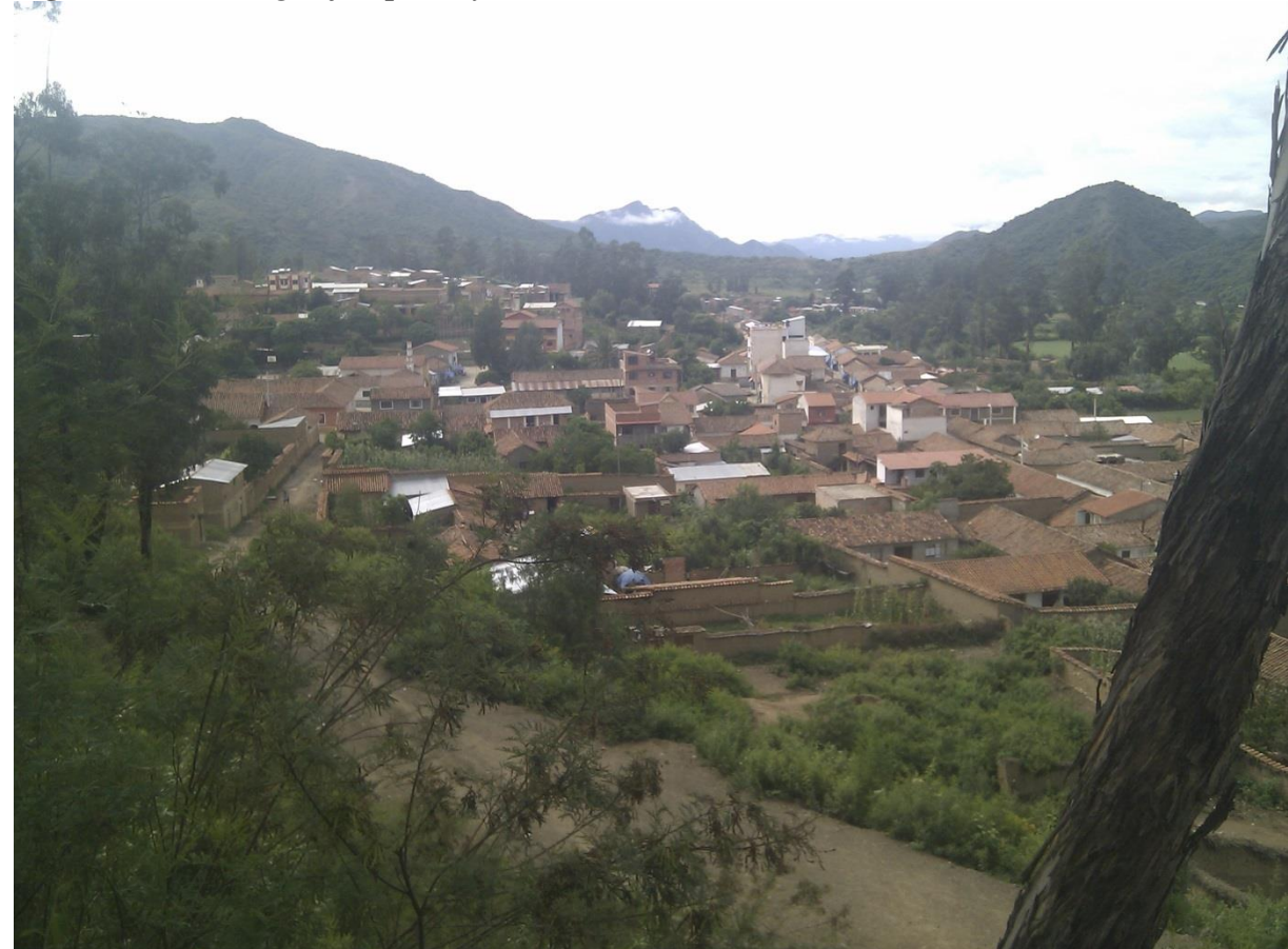
Figure 6: The village of Sopachuy