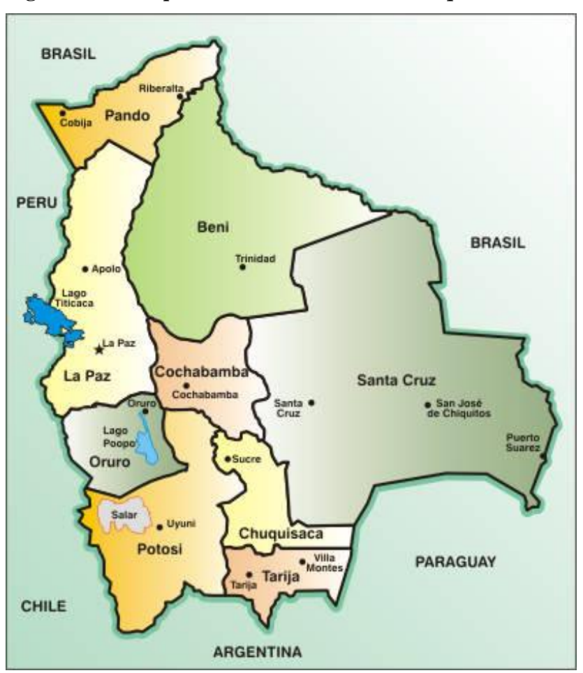
Figure 2: The Departments in Bolivia with Chuquisaca in the south

three geographical zones; the Cordillera Oriental, Sub-Andean and the Llanura Chaqueña (el Gran Chaco). The two first zones are part of the Andes region and the third is characterised by low altitudes and humid and warm climate (Michel (2011). The Municipality of Sopachuy is located in the province of Tomina in the centre of Chuquisaca. Sopachuy is located in the valleys of the Cordillera Oriental in altitudes ranging from 1500- 3000 m.a.s.l. (Michel (2011:10), more specifically Sopachuy is situated at 1 850 m. a. s. l. (FH 2010:12). The village and some of the low-lying communities in the municipality are surrounded by two rivers that don't run dry. The Municipality was funded by the Inca Roca in 1831, and was in earlier times called Sopaychuru which means; "The Island of the Devil" (Pasos 2012). The distance from Sucre is 185km, there is access to the village all year around but in the rainy season the road can be temporarily blocked by landslides.