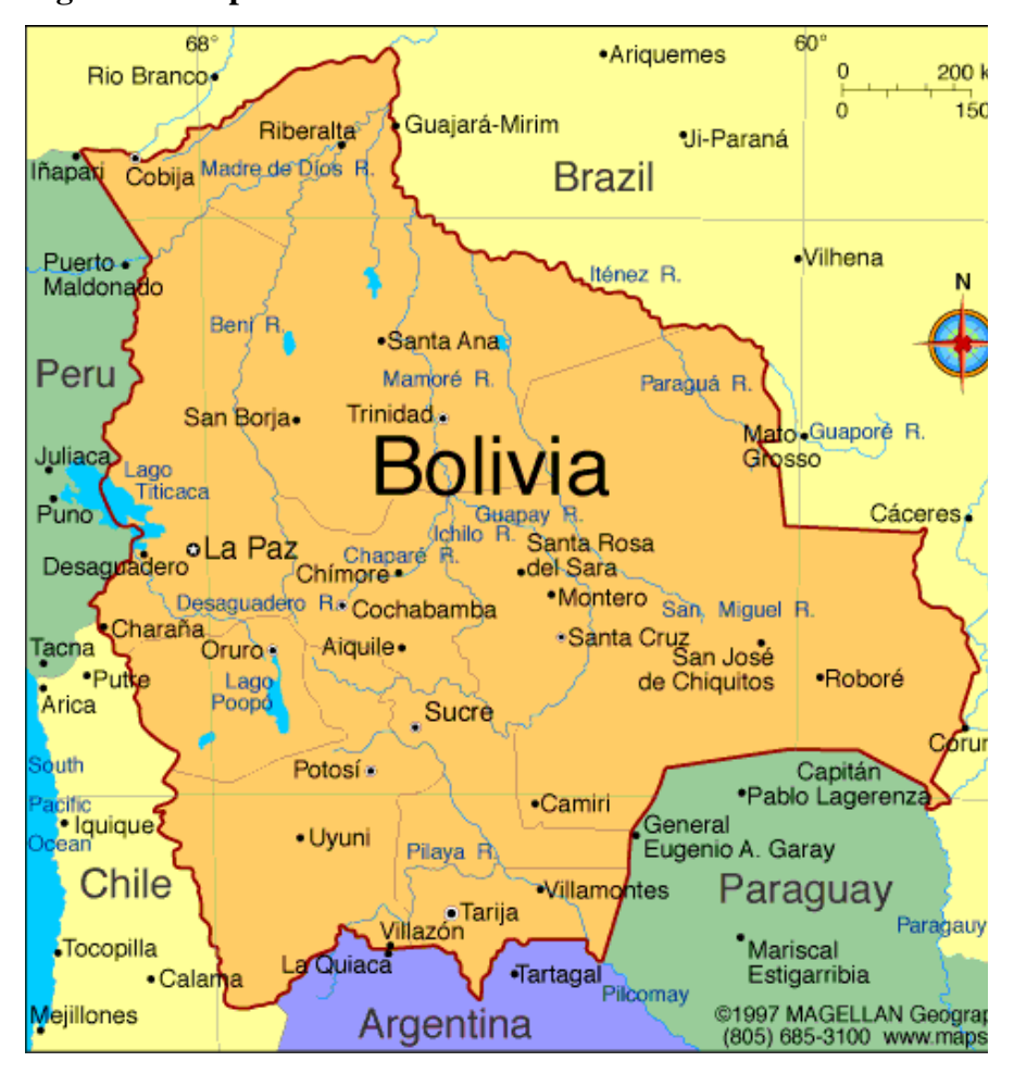
Figure 1: Map of Bolivia