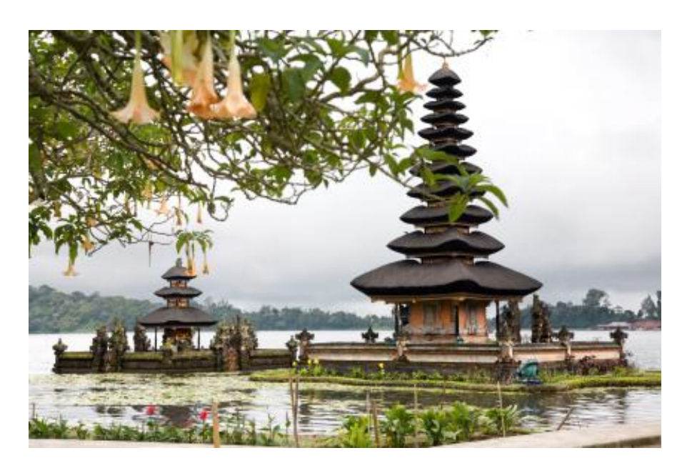
Picture 4: Pura Ulun Danu Temple (water temple), Bali.

Subaks rely on a temple network for guidance, a network which is regulated by priests (Sepe, 2000). These temple systems govern daily activities, farming schedules, and religious ceremonies (Sepe, 2000). The temple networks sustain good harvest by establishing planting schedules that provide enough water for every farmer in the subak system (Lansing, 1991). This reflects the importance of understanding the religious aspect of this organization.