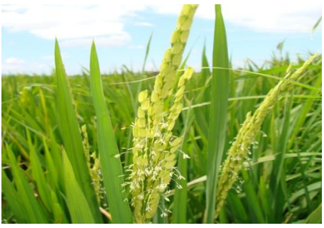
Master's Thesis 2011 Tine Knutsen Sørdalen