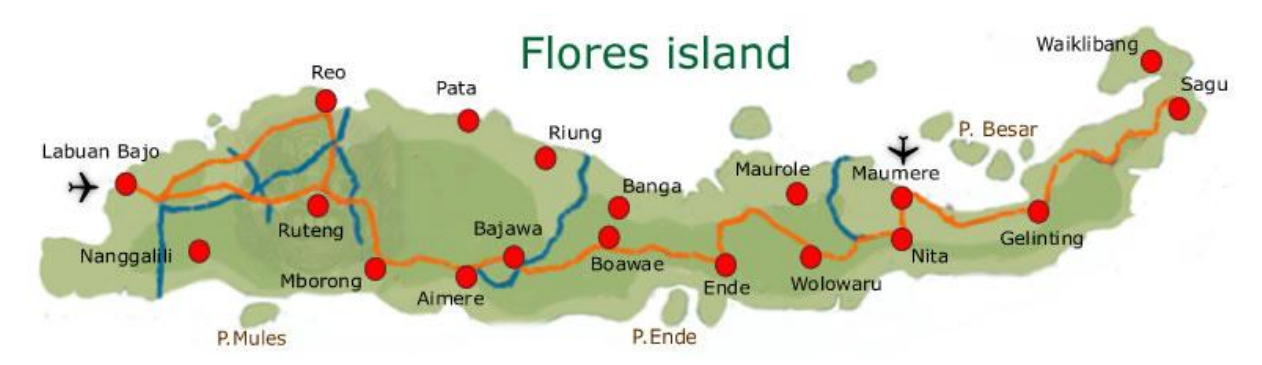
Figure 1: Map of Flores Island.

Flores is another island of the Republic of Indonesia with 17,164 square kilometres, and is one of the Lesser Sunda Islands in the Nusa Tenggara province (Columbia Encyclopedia, N.A). The island has a population of 1,831,472 (BPS, 2010) and is divided into eight kabupatens (regencies); Manggarai Barat, Manggarai Tengak, Manggarai Timur, Ngada, Nagekeo, Ende, Sikka and Flores Timur (Skogseth, 2010). The population is mainly Roman Catholic (85%) (Skogseth, 2010); those in the West are primarily Malays, while those in the East Papuans (Columbia Encyclopedia, N.A).