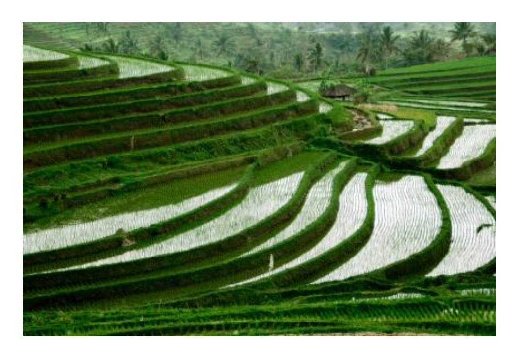
Picture 3: Irrigated rice terraced fields in Jatiluwi, Bali.

The subak system is amongst the famous traditional WUAs, which are assemblies of water users cooperating in the management of a water system. These organisations are operating at a limited localised level, and are joint associations of individual water users who wish to carry out water-related activities for their mutual advantage (Carter, 1998). A WUA is basically a participator, bottom-up organisations and may employ management control only if they have been assigned the authority to do so (Carter, 1998).