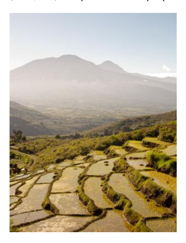
Picture 2: Terraced rice fields, Flores.

Human activity can lead to degradation of land quality (UNEP, 2007). Soil erosion can occur due to poor land management, such as an overuse of fertilizers and pesticides (UNEP, 2007). However, terracing is one countermeasure that overcomes the impacts of land degradation (UNEP, 2007) and is practiced in the steep slopes of Flores.