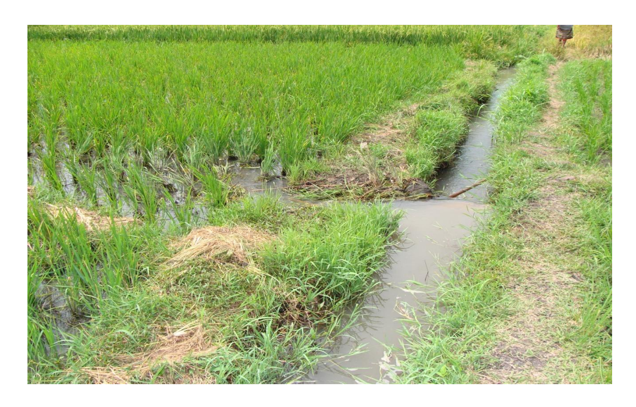
Picture 6: The manual channels going in to the different fields in Lembor.