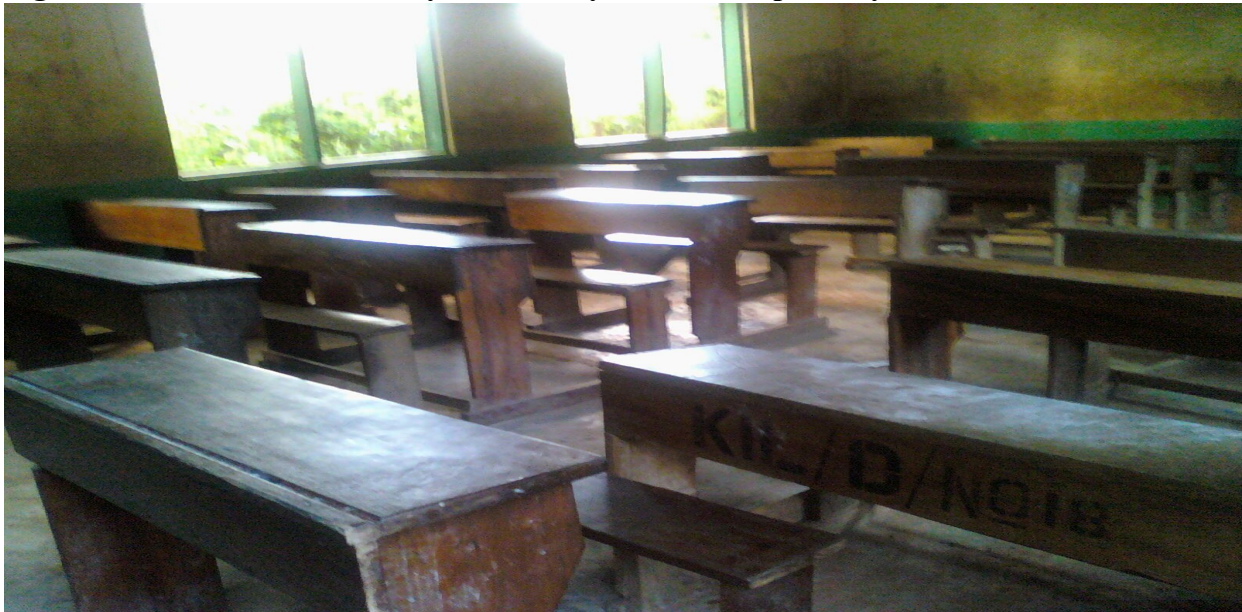
Figure 12: Desks constructed by community at Kilakala primary school

The parents/ community contribute either in cash or in kind (labour) to the construction of the desks and tables. For example, the community at Mindu primary school they used to go to the forest and cut wood and construct the desk in their own cost. The community contributes Tsh. 1000 for each household to get the money to pay for carpenters who constructed that desk/chair. Tsh. 1000 is equal to $ 1 dollar in which the people can afford to pay compare to the cost of construction of classroom or houses. The community at Kilakala primary school contributes money in construction desks and tables. Each parent has to pay Tsh 15,000 ($15 dollars) yearly as the contribution for the school development. The school takes 30 percent of the money collected for the construction of desks, table and chairs. The reasons for the people at Kilakala to use money as the way of contribution explained in other activities explain earlier.