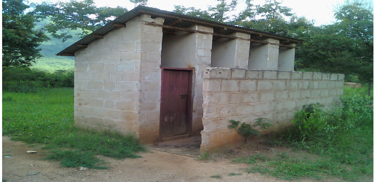
Figure 10: The toilets built through community participation at Mindu Primary School

chairperson of school why they do not constructed water taps for the children at school. They responded that, the majority of the population in the community use water from the dam for home consumption. They argued that there is no problem for their children to collect the water from the dam and disagreed to construct modern water taps.