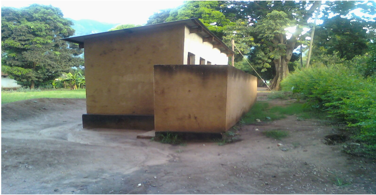
Figure 11: Toilets built by community at Kilakala Primary School

Construction of Desks, chairs and Tables