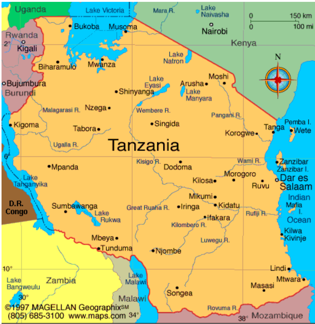
Figure 1: Map of United Republic of Tanzania