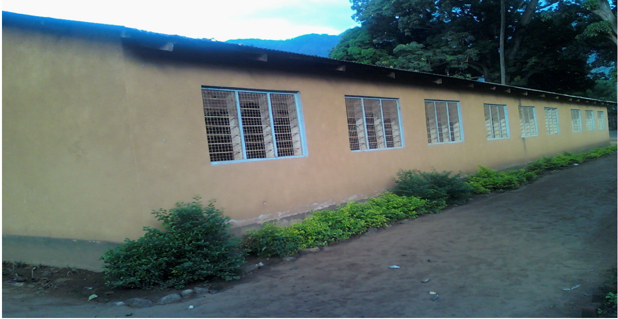
Figure 8: The new classroom built through community participation in 2002 at Mindu Primary School