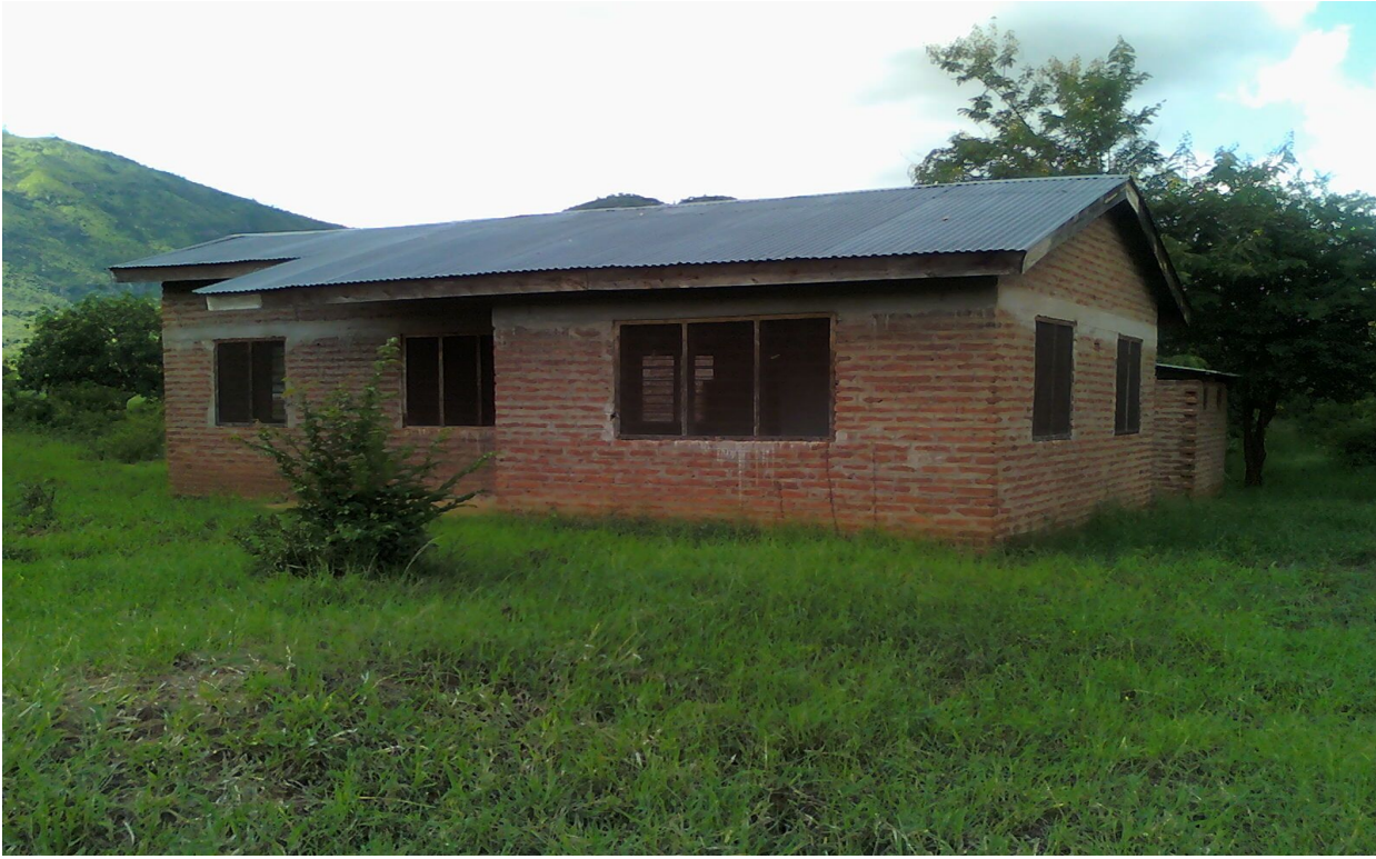
Figure 9: One of the Teacher's Houses built by the community at Mindu Primary School in 2002