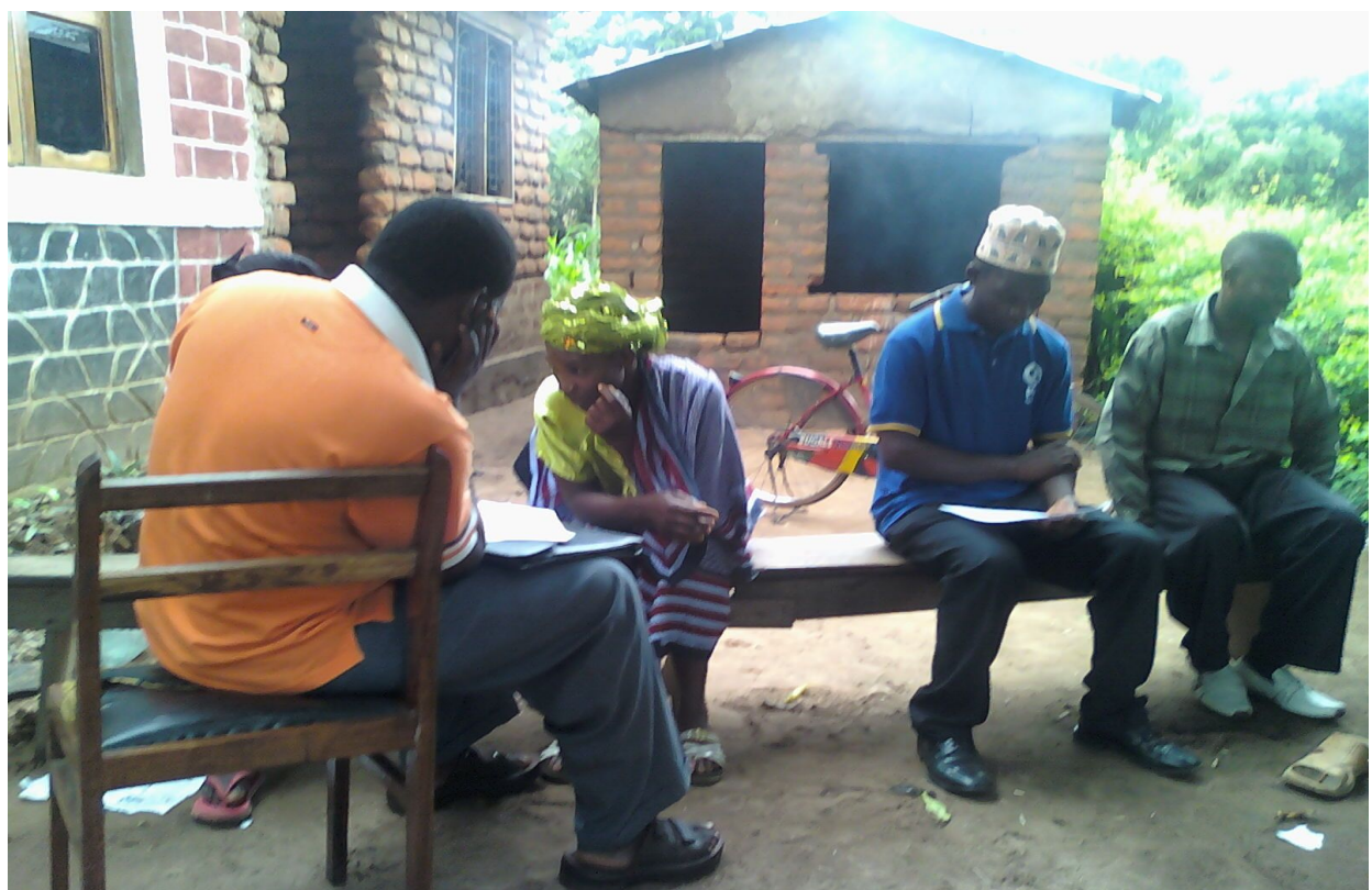
Figure 5: The researcher conduct unstructured interview with local people in the community at Mindu area.

Generally, the interview method provides an excellent opportunity to probe and explore questions. According to Rwegoshora (2006:128) recommended that this method is very useful because it help the researcher to know about the subject matter at first hand. During the interview processes the respondents/interviewees were free to answer the questions as they wishes and given chance to ask questions for clarification. I prepared the interview guide to ensure that I cover the targeted areas during the interview. The most disadvantage of this method is that sometime, the respondents provide irrelevant information for the study and time consuming.