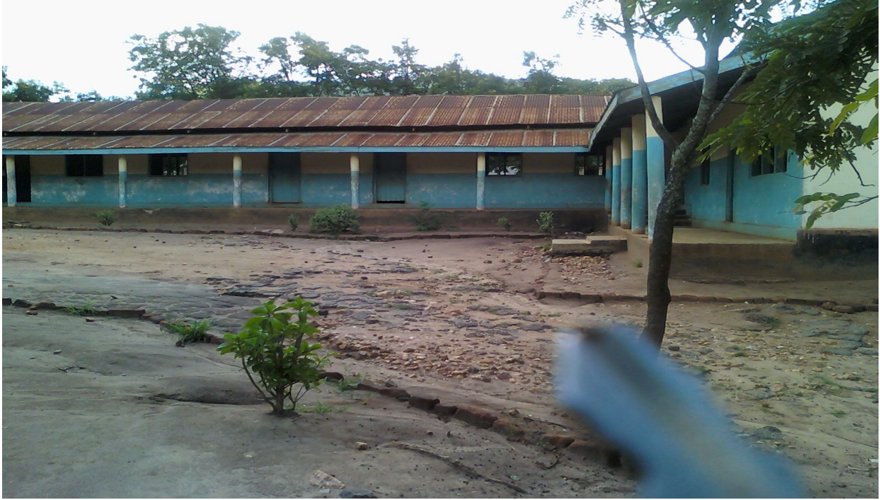
Figure 7: The classroom built by government in 1970s at Mindu Primary School