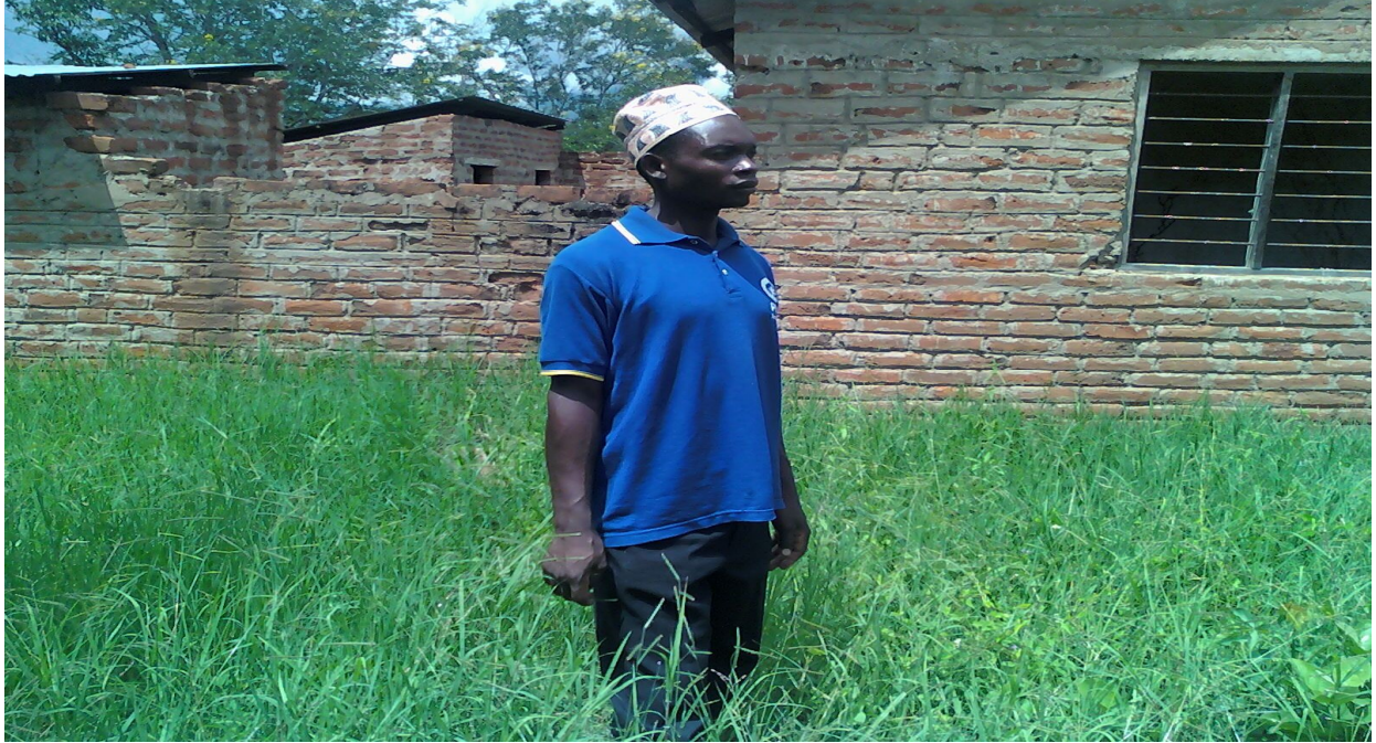
Figure 6: One of the teacher's houses which the community failed to complete since 2004 at Mindu Primary School.

The statement above shows to extent the community does not support the development of their school. The head teacher stated that the program of building teacher's houses stated since 2004 but still to this moment is not completed. He argued that people are not committed with their decision when it comes to the implementation. Example, the community in 2006, decided to contribute Tsh. 2000 ($ 2 dollars) from each household for building toilets in teacher's houses but up to this moment, only 24 households contribute that amount. The Mindu Ward has more than 300 households; therefore, only 8 percent of the households contribute to what they decided.