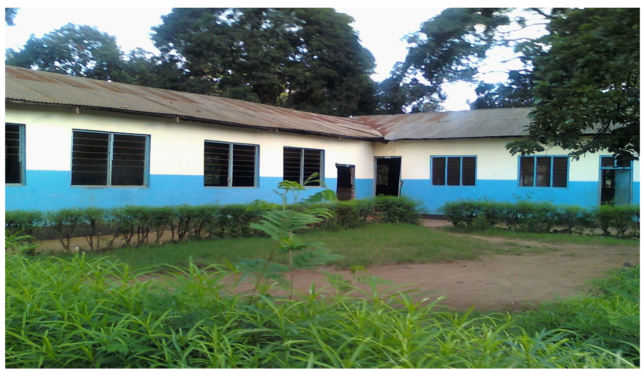
Figure 2: Kilakala Primary School