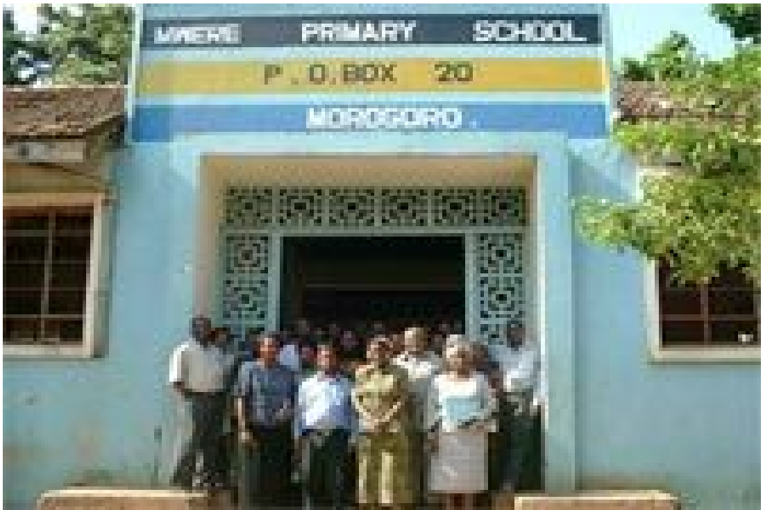
Figure 4: The training for primary teachers organised by PEDP, Morogoro

Moreover, the Primary Education Development Plan (PEDP) brought positive changes in development of primary education in Tanzania especially in rural communities. The Minister of Education and Vocational Training, Margaret Sitta (2007) explained in details on the achievement of PEDP in the country. The minister argued that PEDP increase the Net Enrolment Rate (NER) from 80.7% in 2002 to 96.1% in 2006, Gross Enrolment Rate (GER) form 98.6 in 2002 to 112% in 2006, pupils pass rate increases from 27.1% in 2002 to 62% in 2006. The transition to from primary to secondary school increases from 21.7% in 2002 to 49.3 in 2006. Therefore, the Primary Education Development Plan contributes a lot to the primary education development in Tanzania.