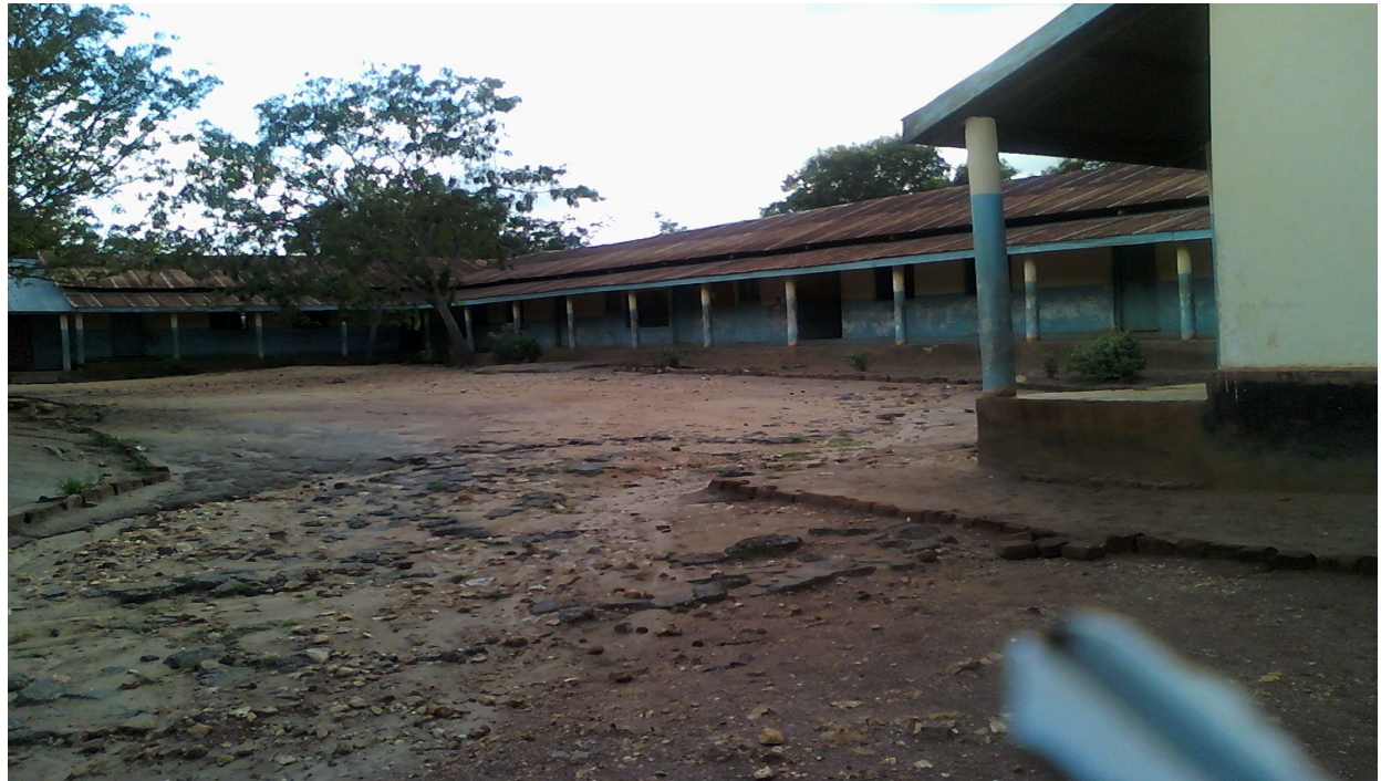
Figure 3: Mindu Primary School – Classrooms