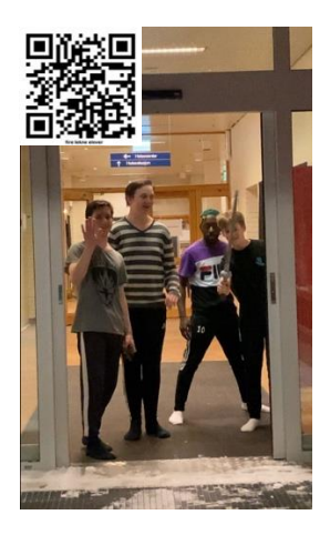
Video 1 Meet the pupils.

In the following section, we describe the different steps and take the reader into "trembling moments" in which the process changed and the participants with it.