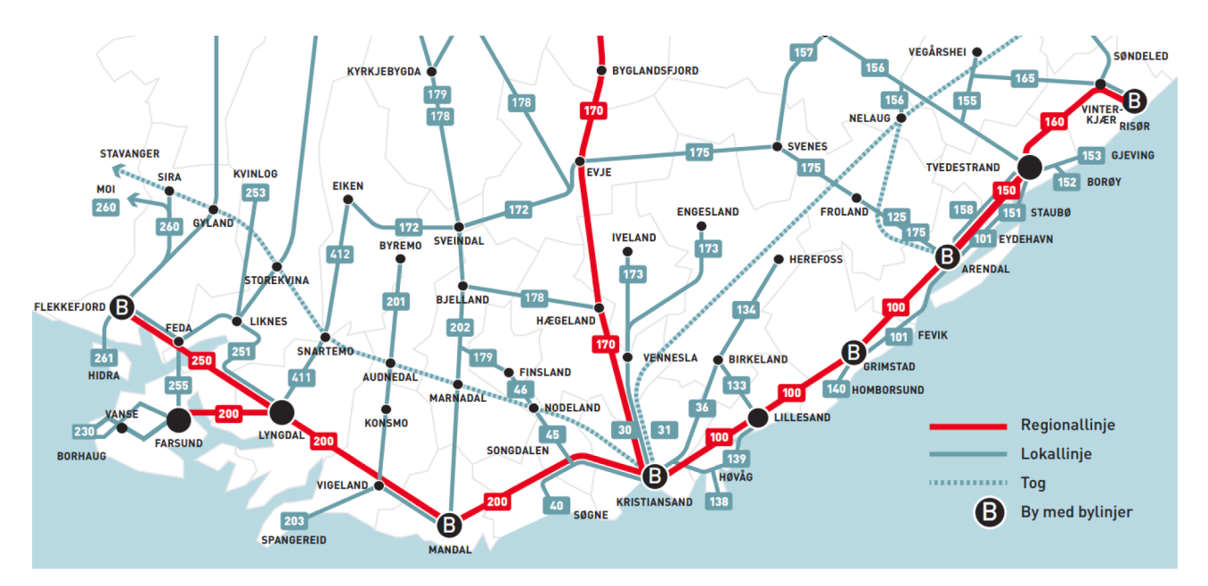
Fig. 1. Regional public transport network of Agder, Norway.

The PT fares in Agder are zone based, with one zone corresponding to one municipality. Table 2 gives an overview of the fares for adult single tickets and monthly passes charged by AKT in January 2022 (prices in euros are estimative, calculated with a rate of 10 NOK (Norwegian Kroner) per 1 EUR (Euro)). As an example, a single ticket between Arendal and Kristiansand (four zones) costs 130 NOK (approx. 13 EUR) if bought before boarding the bus, for a distance of 64.4 km and a travel time of 90 min with the regular bus connection, or 62 min with the direct bus route that has four departures a day during rush hours. Estimated driving time for the same distance is approximately 60 min, and the costs are 259.5 NOK, according to public reimbursement policies in Norway which include car wear. When only gas and toll prices are considered, a price of approximately 100 NOK is achieved for the same distance (76.6 NOK – conservative estimate of 17 NOK per litre for fuel