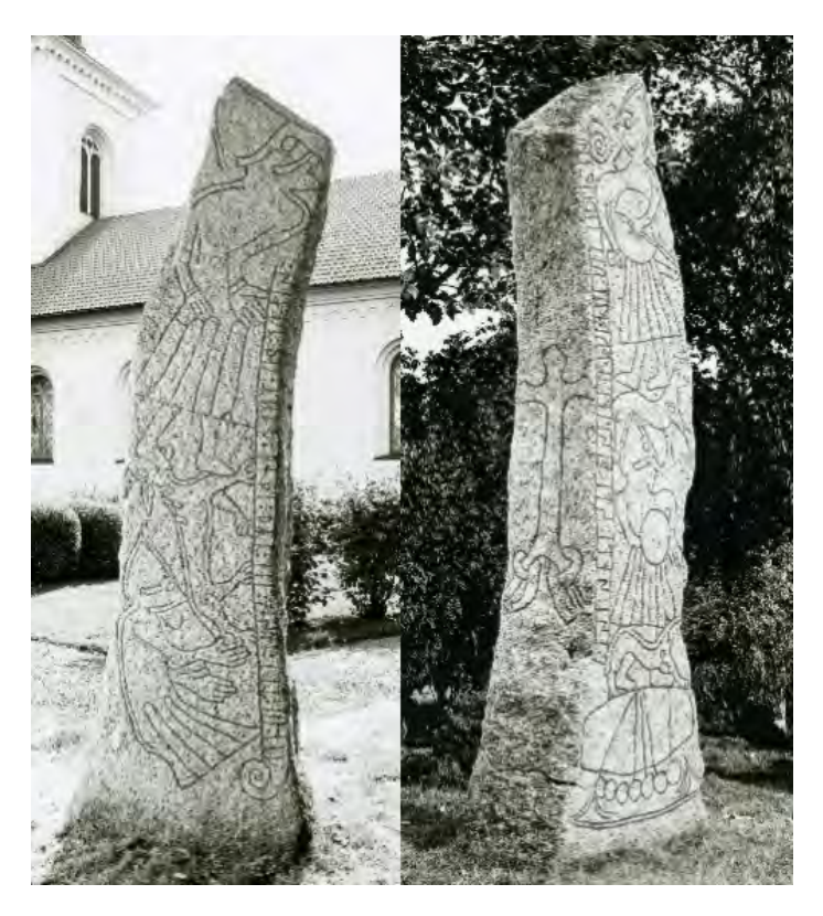
Ill. 1. The Ledberg runestone (Ög 181) with its Ragnarǫk iconography, a cross and a memorial inscription followed by the bistill-mistill-kistill formula. Photo: Arne Gustafsson, Swedish National Heritage Board; Magnus Källström kindly provided me with the image files of illustration 1 (in an email dated July 6, 2021). Cf. Källström (2016: 269) and (2020: 17).

Memorial inscription on the Ledberg stone (AD 1000–1050)<sup>27</sup>