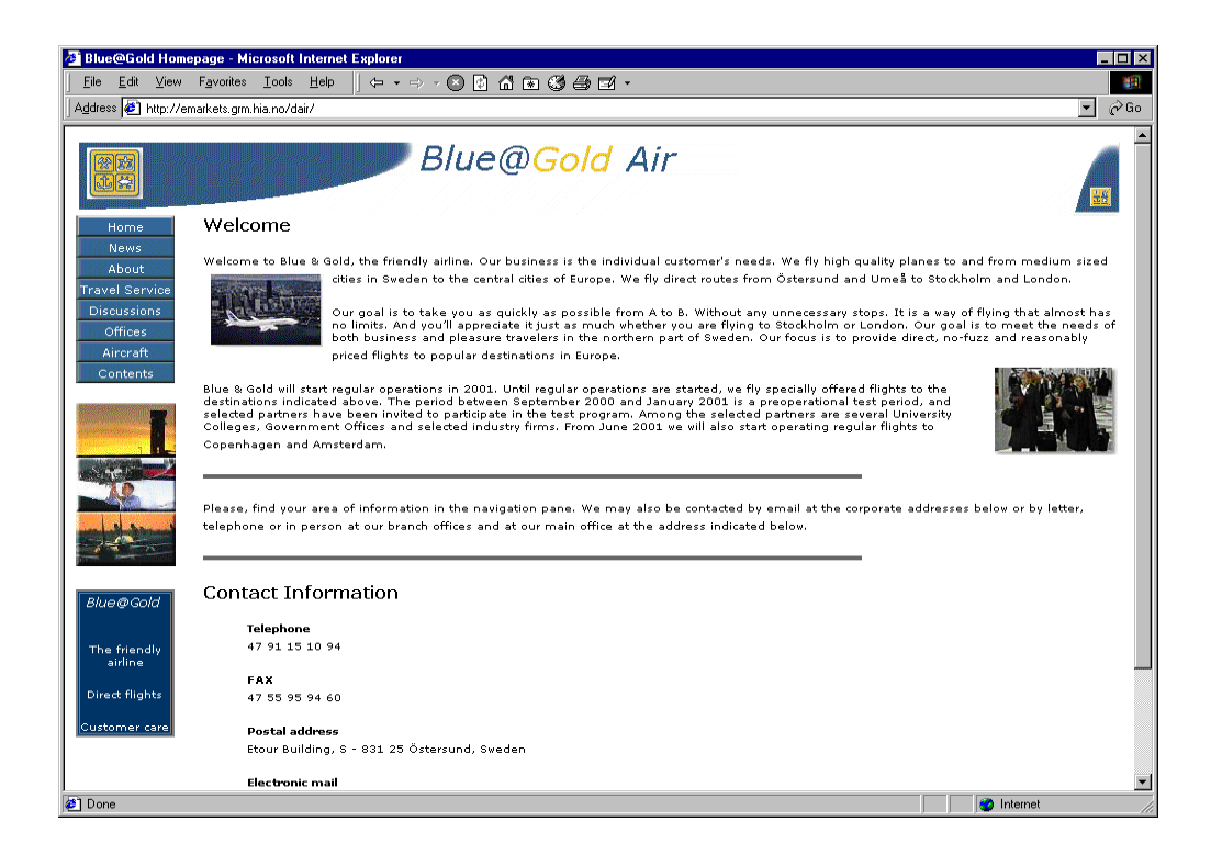
Figure 2: Web-sites for Blue & Gold Air and Blue & Gold.