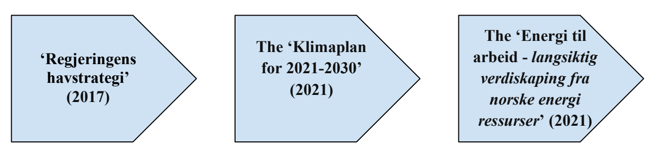
Figure 5.2: Description of the currently relevant documents for Norway in this transition

Margetts, 2007, p. 86-87). Enova is also given the responsibility for being the primary financial instrument regarding support for floating offshore wind. The Ministry of Petroleum and Energy has established the 'OG21' and 'Energi21' strategies through the Research Council.