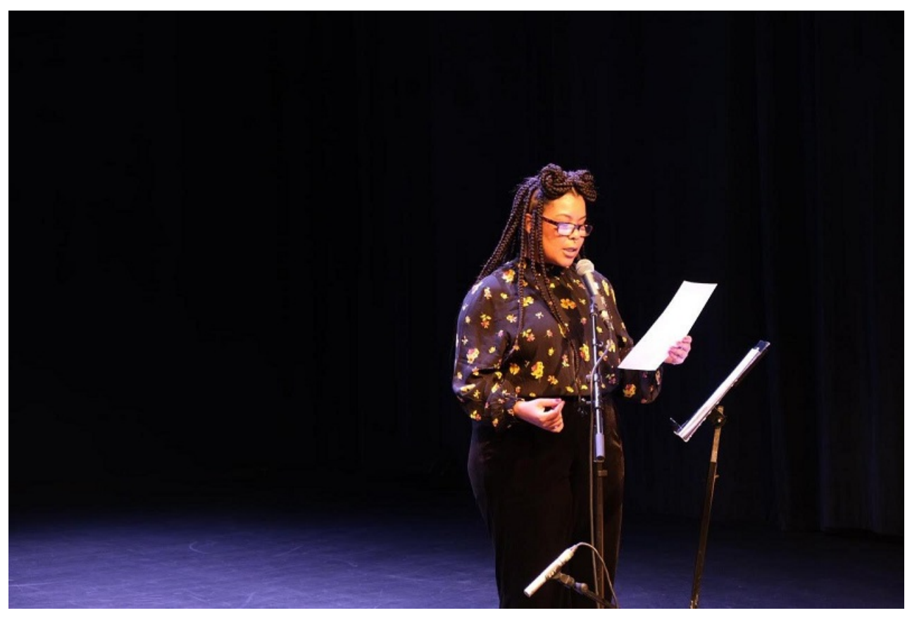
Photo from Deise Nunes' Decolonizing the Performing Arts II: The Gaze, Colonialism and Aesthetics .

When we raise our heads towards the stage, our horizon expands immediately. The theatre opens our gaze, perspective, senses, understanding and imagination. It would have made sense to prioritize the normal functioning of art venues during the pandemic, at a time when our lives have been particularly challenging. They are places where you can be alone with others, where everyone has gathered for a collective yet subjective experience in the here and now.