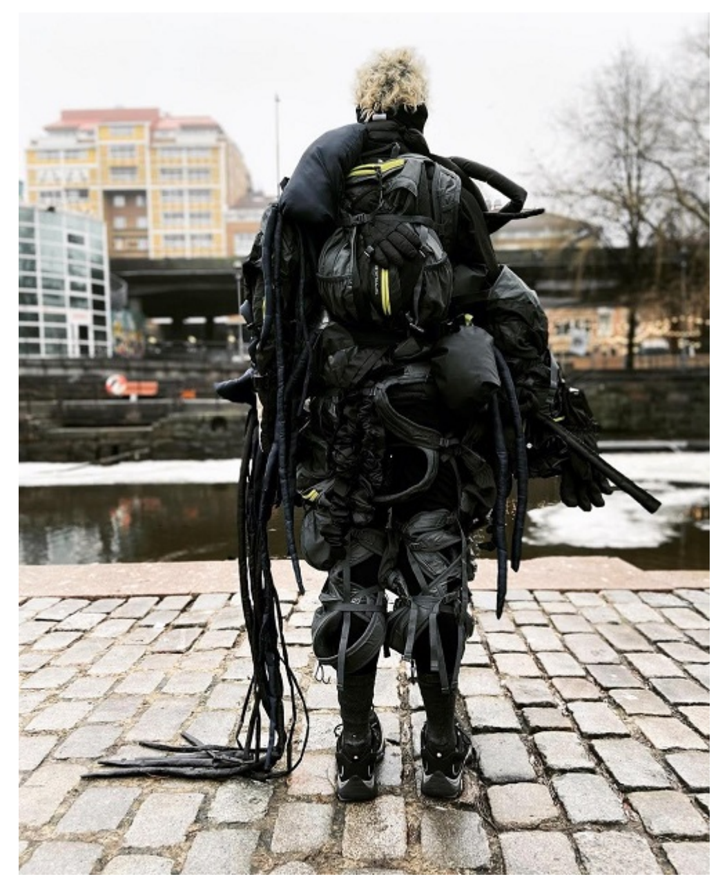
From Fiksdal/Floen/Slåttøy's (cancelled) performance Fictions of the Flesh .

We worked on three different scenarios. I structured the program in such a way that risks would be minimized, and I focused on the remaining accessible spaces. We designed a section of the program that would be preserved intact, no matter what. This part included an outdoors performance with one performer by Fiksdal/Floen/Slåttøy, but, in the end, it was not allowed. I don't think anyone expected the restrictions to play out this way again, especially just a few days before the festival opening. I had thought we were prepared, but it turned out that I was not pessimistic enough.