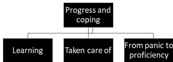
Figure 3. The main theme progress and coping with the three subthemes learning, taken care of, and from panic to proficiency.

“Probably did not have enough willpower to do this alone.”