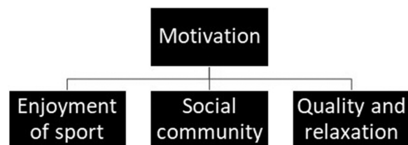
Figure 2. The main theme motivation with the three subthemes enjoyment of sport, social community, and quality and relaxation.

"Always liked the context of exercising, the social setting of doing sports."