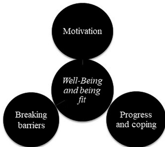
Figure 1. The three main themes that emerged from the analysis: 1) motivation, 2) progress and coping, and 3) breaking barriers coping. These fit within the study's main finding and overarching theme well-being and being fit.

three focus groups and four to five participants in each of these groups ought to be sufficient for both code and meaning saturation (Hennink et al., 2019).