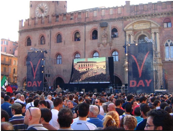
Figure 1. The V-day square.