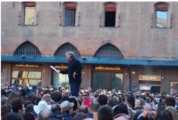
Figure 2. Grillo at the V-day.

challenging the traditional way politics takes place. For its size and relevance in the political system, the M5S represents an important eParticipation initiative at the global scale. Hence, the exploration of the M5S case makes it possible to reflect on processes and structures through which digital technologies support the relationships among citizens, governments, and public organizations.