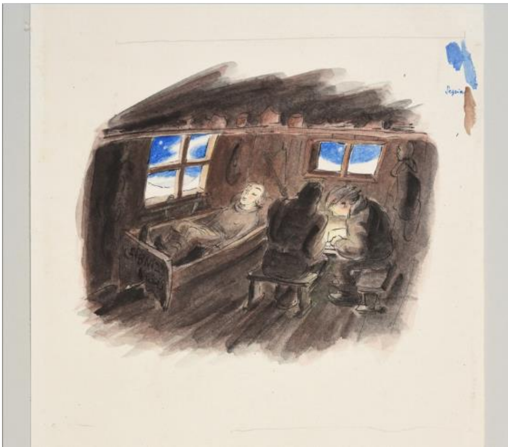
Figure 2: Christiane Ritter, untitled watercolour housed at Svalbard Museum. Please contact Stiftelsen Svalbard Museum to obtain permission to use the artwork. A black and white copy of this painting is also featured in the German editions of the book, in chapter 10.

Of course, the reader knows that this is a memoir, and knows that Ritter, at least, returns to tell her tale and paint her pictures. We can only imagine – in the strangeness of our own minds and memories – what it might be like to feel so at one with the moon and the sea that we can simply merge ourselves with them. Perhaps this is what Captain Scott and his companions recognized when they let Oates walk to his death with his now famous words that every British child learns by heart: ‘I am going out now. I may be some time.’ 5 Whereas Oates’s gesture is considered a heroic, selfless act to save his companions the trouble of dealing with his remains, in Ritter’s text, as in the watercolour shown in Figure 2, she portrays her rar as the housewife betraying her duties. In a role reversal it is the men who are painted as busily writing while Ritter lies on a bunk; in the text she tells us that they make her food rich in seal fat and cod liver oil, and cake with dried fruits, for it is after all nearly Christmas.