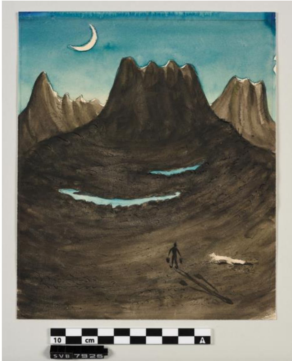
Figure 1: Christiane Ritter, untitled watercolour housed at Svalbard Museum. © Christiane Ritter. Please contact Stiftelsen Svalbard Museum to obtain permission to use the artwork.

Returning to Ritter's text, silence is present in more than just descriptions of it. What is as revealing as what she writes is what she does not write. While she is frank, both in words and in her painting (as we shall shortly see in Figure 2), about her own mental health problems during the polar night, it does not take up much space in the text. Nevertheless, mental health is a recurrent theme in the book. When Ritter's husband first introduces her to Karl, all three of them are in high spirits, and 'Karl (he admitted it to me much later) for a very special reason. He is quite sure that in the storms and the loneliness of the long night "the lady from central Europe" will go off her head' (33, chapter 2). This might strike the modern reader as cruel, ablist, and even sexist: the term 'lady' (in German, 'Dame', rather than the 'Frau' of the title) implies not only a female,