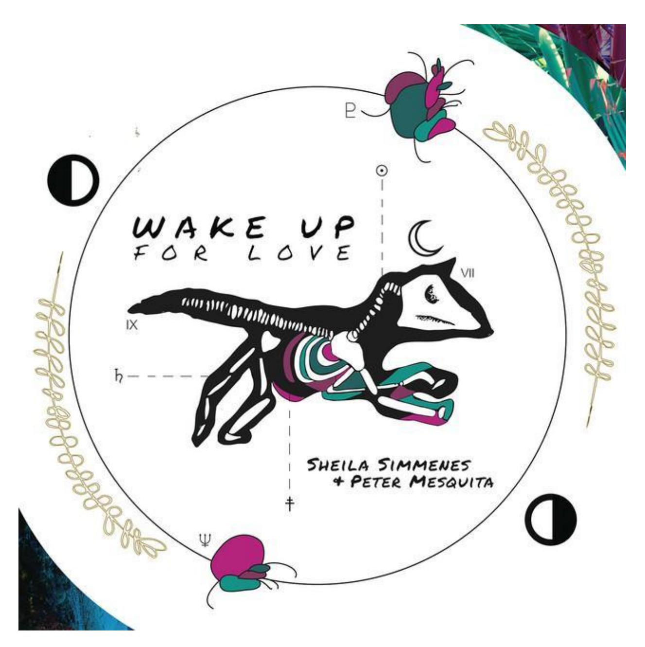
Illustration 2: EP Cover, Wake Up for Love by Sheila Simmenes & Peter Mesquita, JazzHouse 2015.